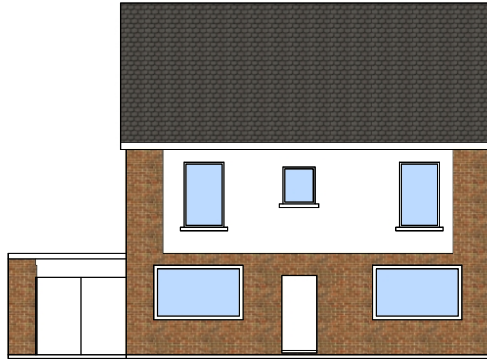
EXISTING FRONT ELEVATION SCALE 1:100 @ A3