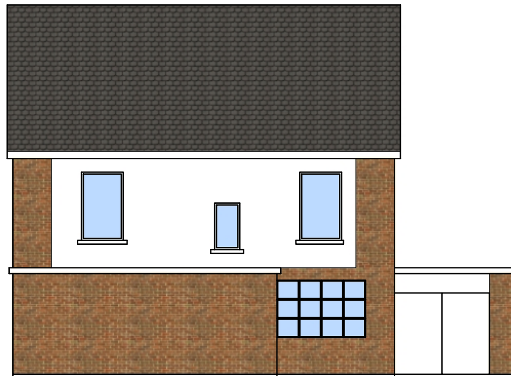
EXISTING REAR ELEVATION SCALE 1:100 @ A3