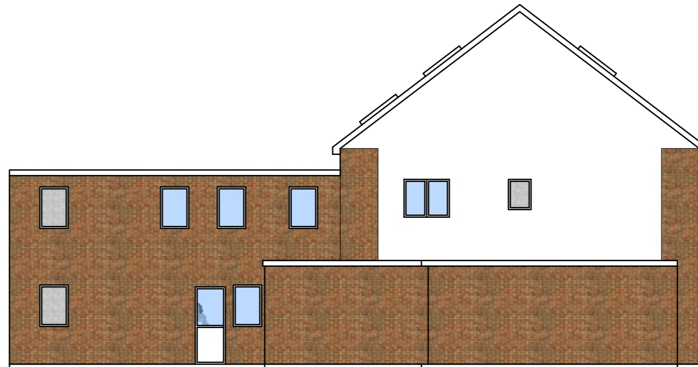
PROPOSED LEFT ELEVATION SCALE 1:100 @ A3