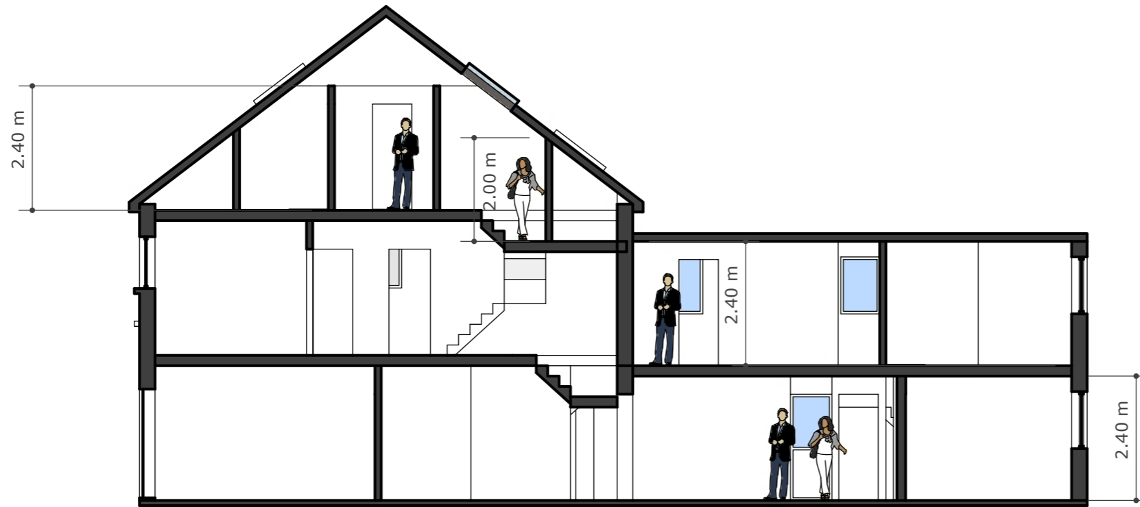
PROPOSED SIDE SECTION SCALE 1:100 @ A3