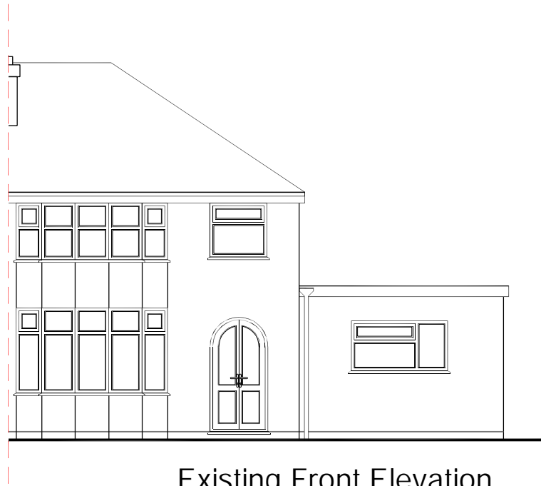
Existing Front Elevation 1:100