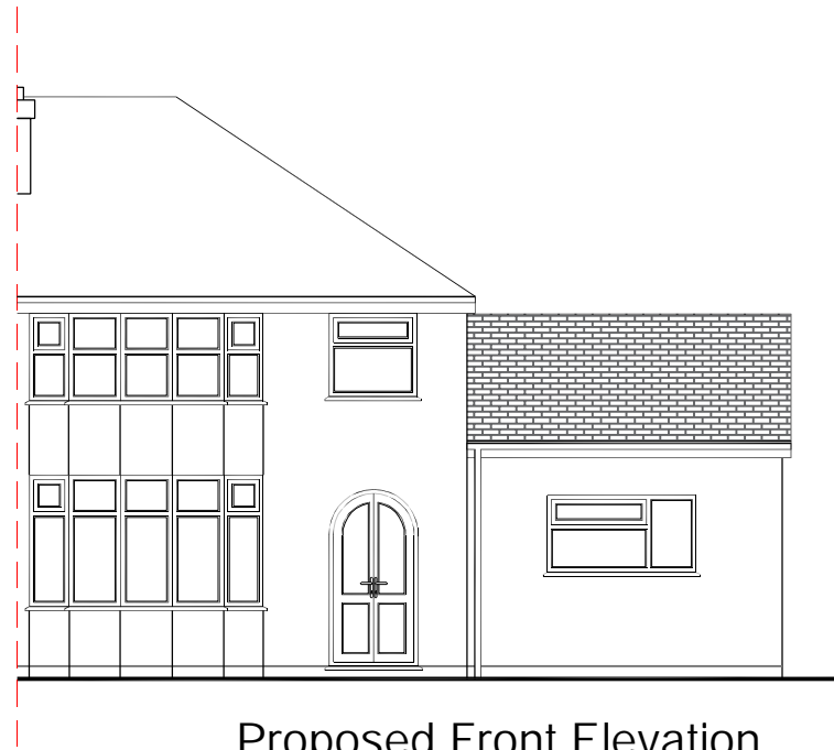
Proposed Front Elevation 1:100