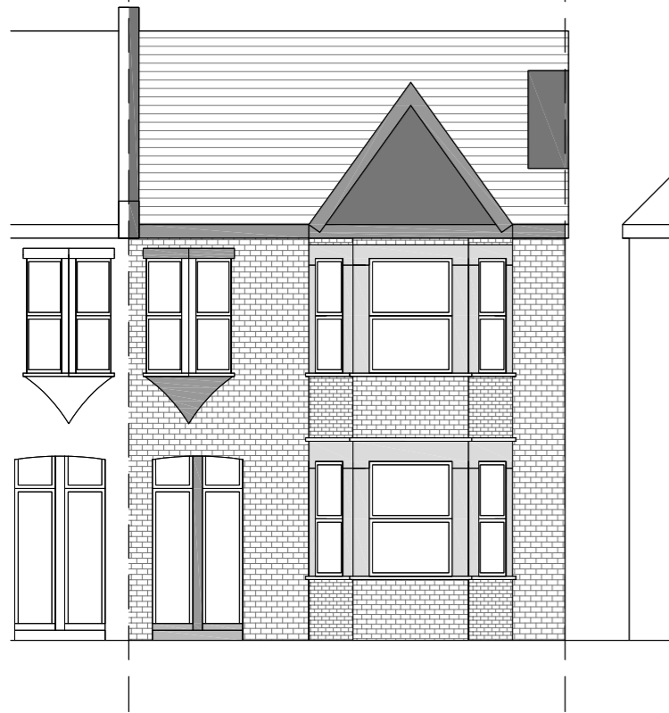
Elevation : Front