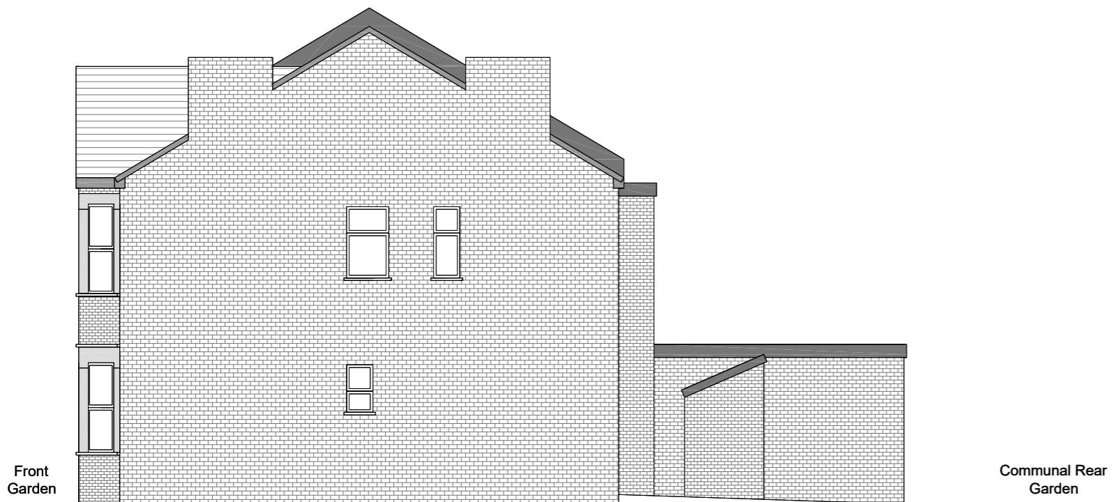
Elevation : Side