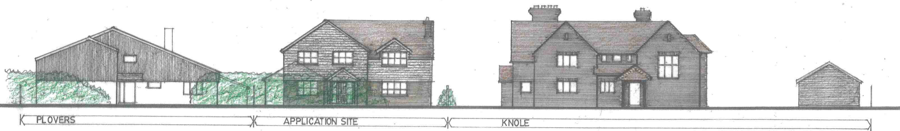
STREET VIEW 1-200 SCHEMATIC - FOR ILLUSTRATIVE PURPOSES ONLY