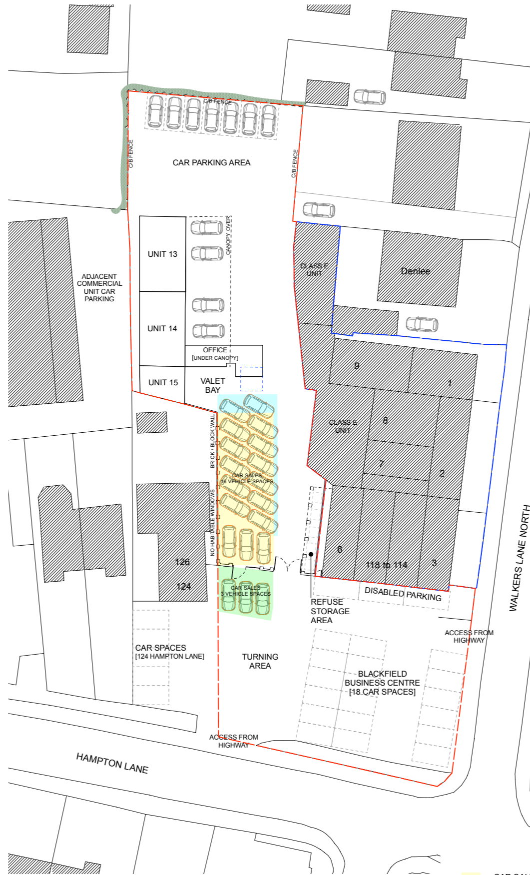
2 proposed site / block plan Scale: 1:500