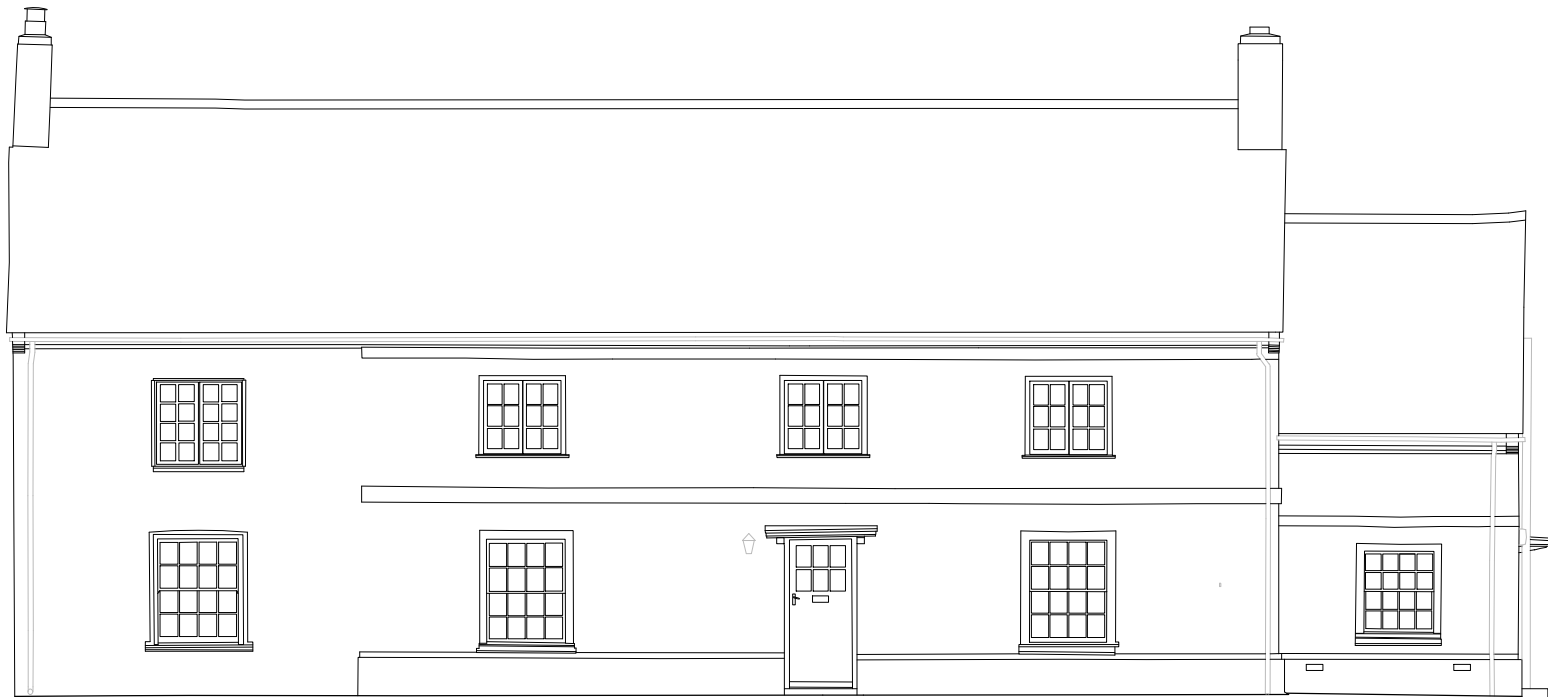
Proposed South-West Elevation