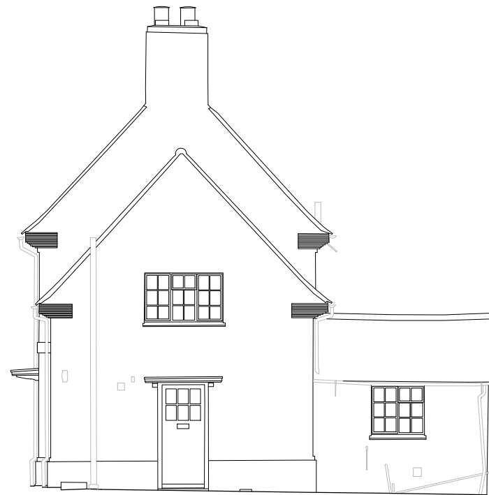
Proposed South-East Elevation