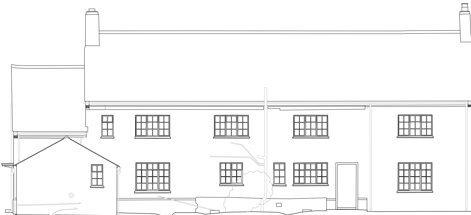
Proposed North-East Elevation