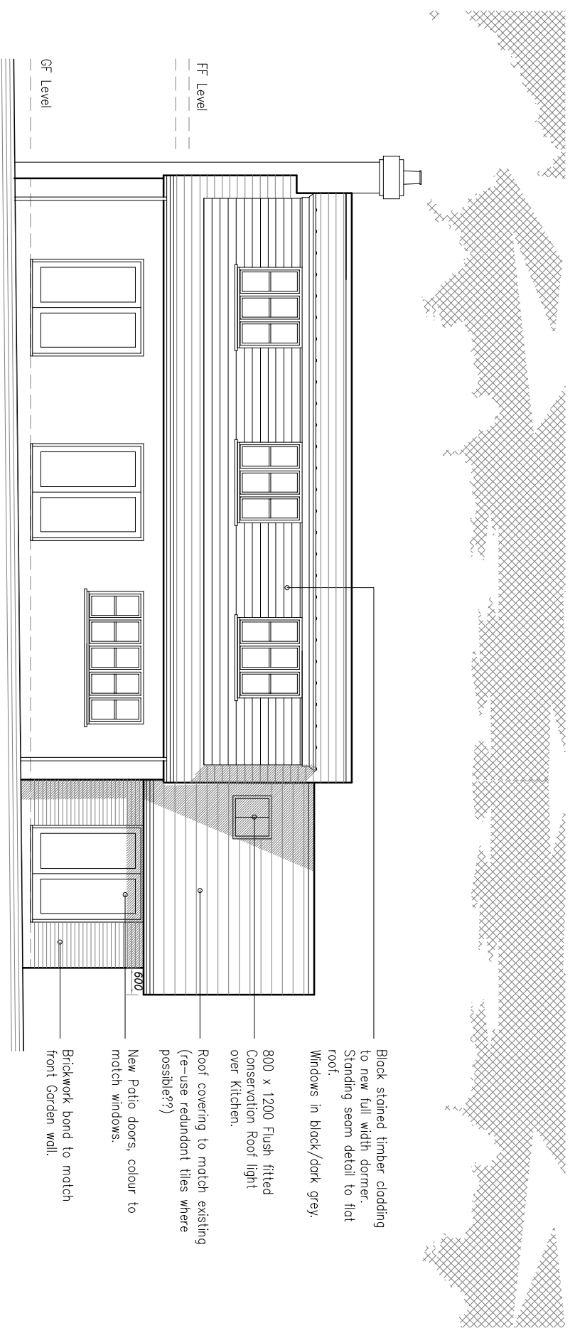
Proposed Rear Elevation (facing North)