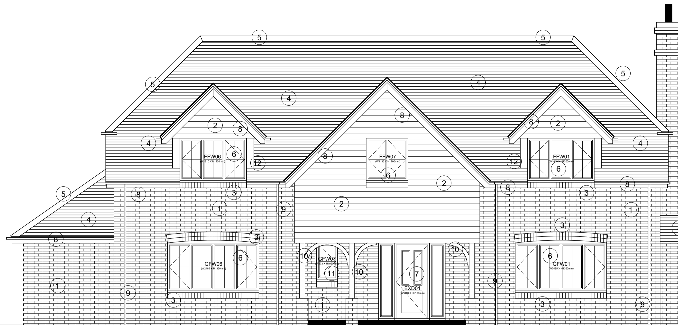
NEW PLOT NORTH ELEVATION (1:50)