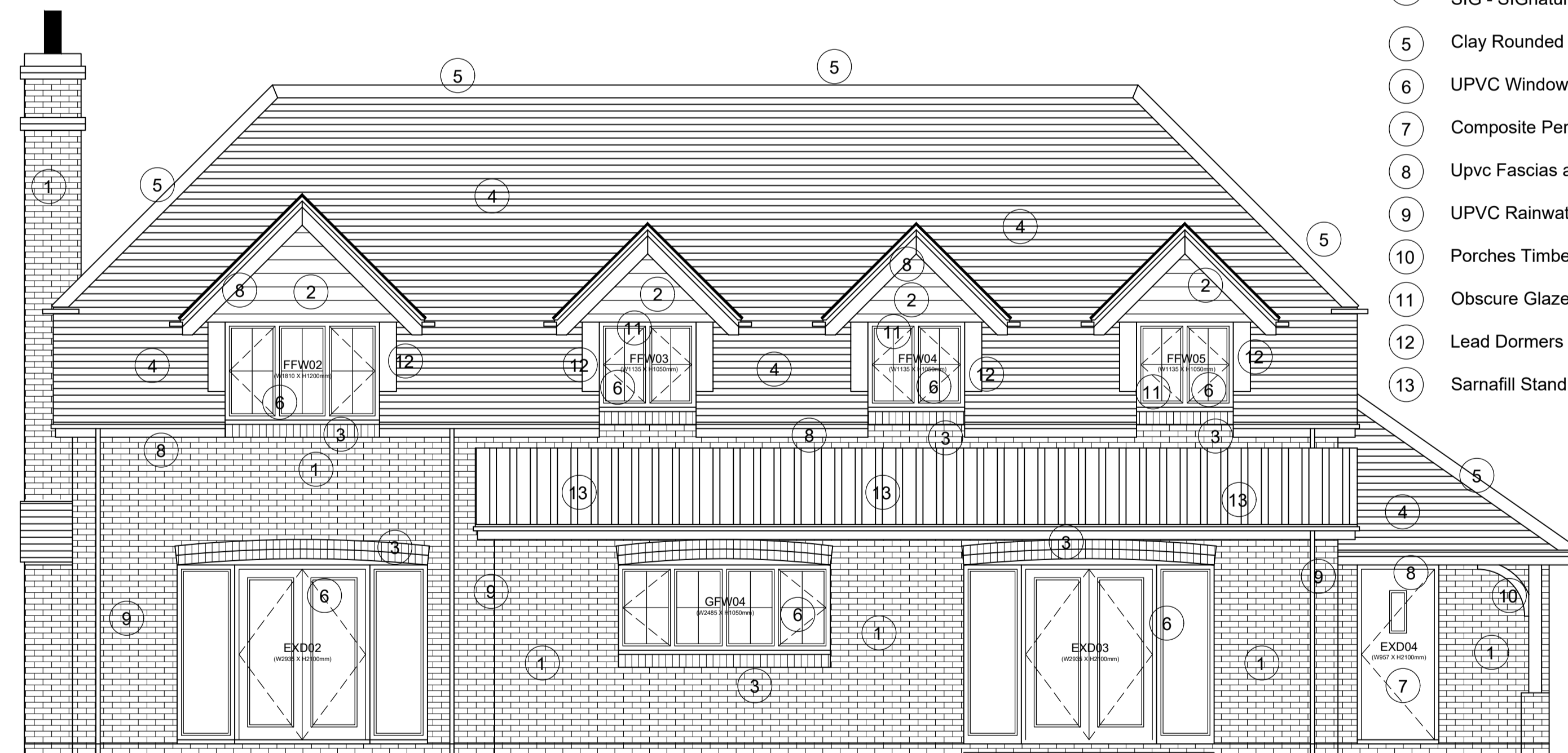
NEW PLOT SOUTH ELEVATION (1:50)