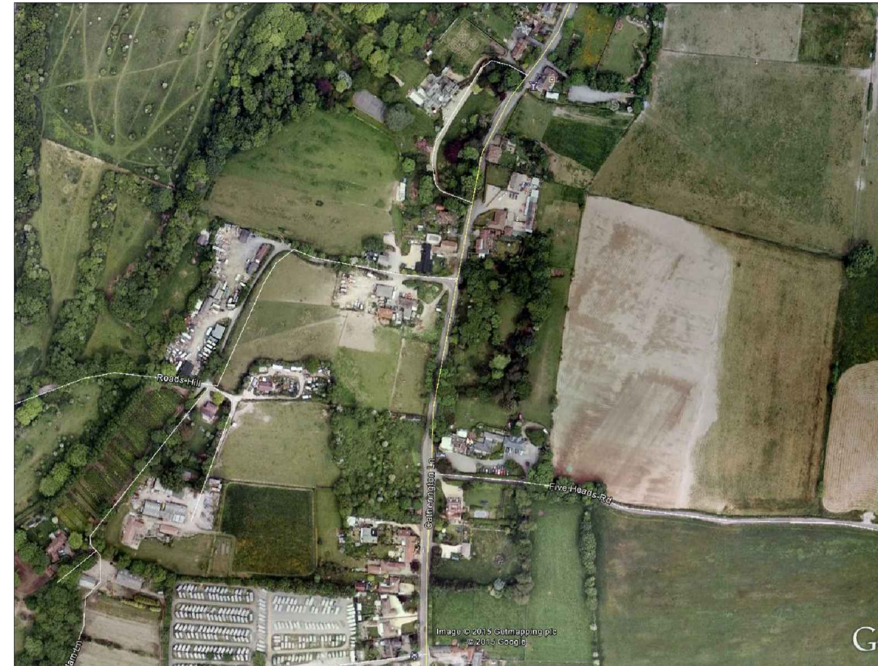
Google Earth plan