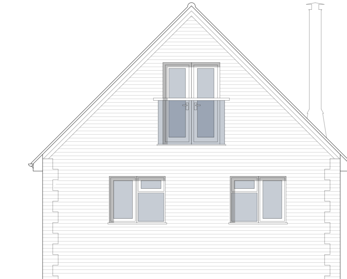
04 EASTERN ELEVATION scale - 1:100