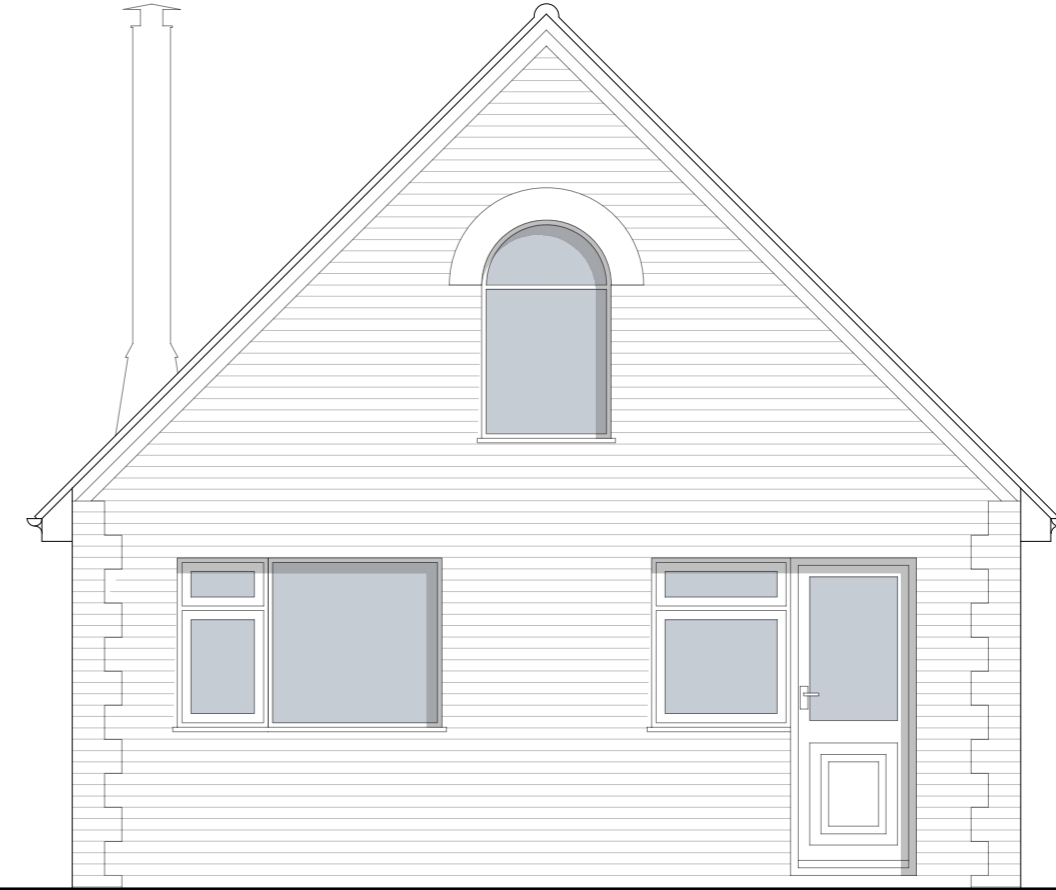
02 WESTERN ELEVATION scale - 1:100