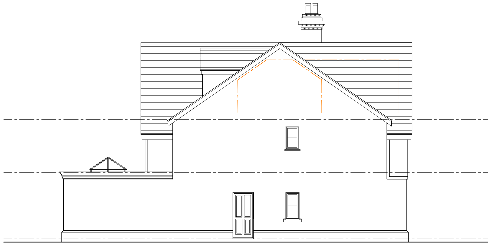
SIDE ELEVATION (EAST)

All dimensions are in millimetres unless noted otherwise.