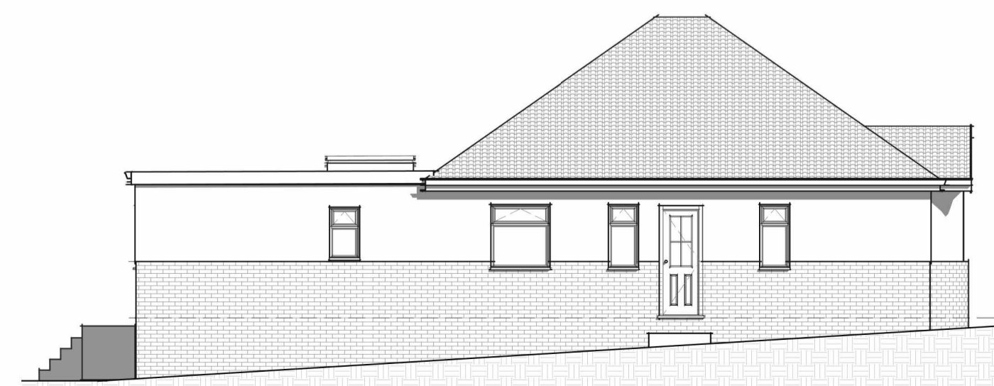
Proposed Side (S) 1 : 100