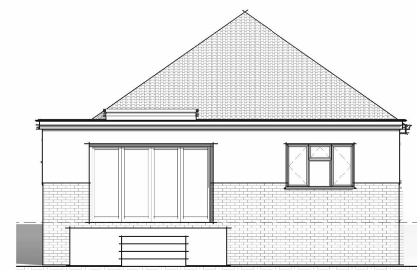
Proposed Rear (W) 1 : 100