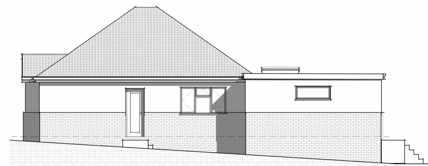
Proposed Side (N) 1 : 100