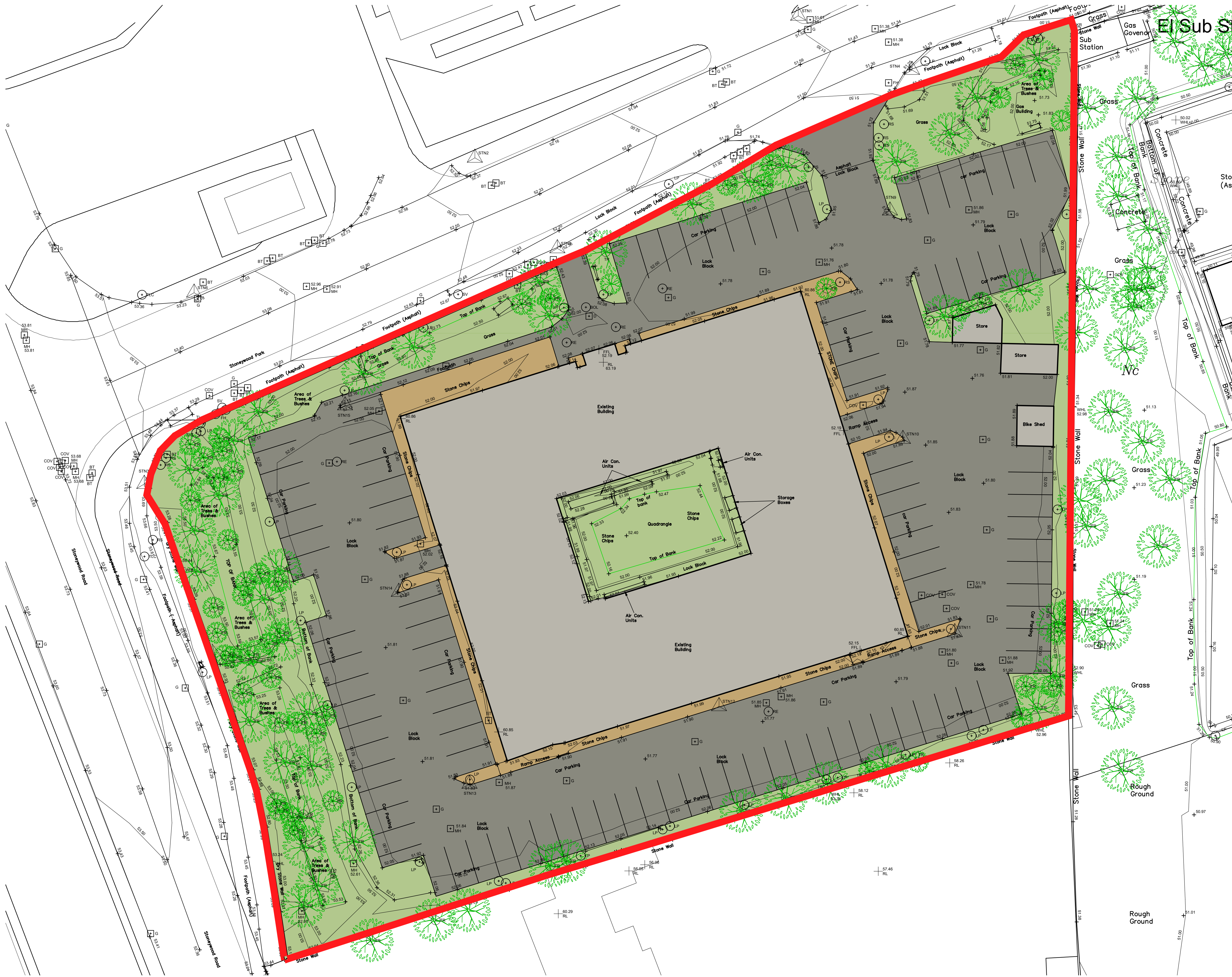
Existing Site Plan