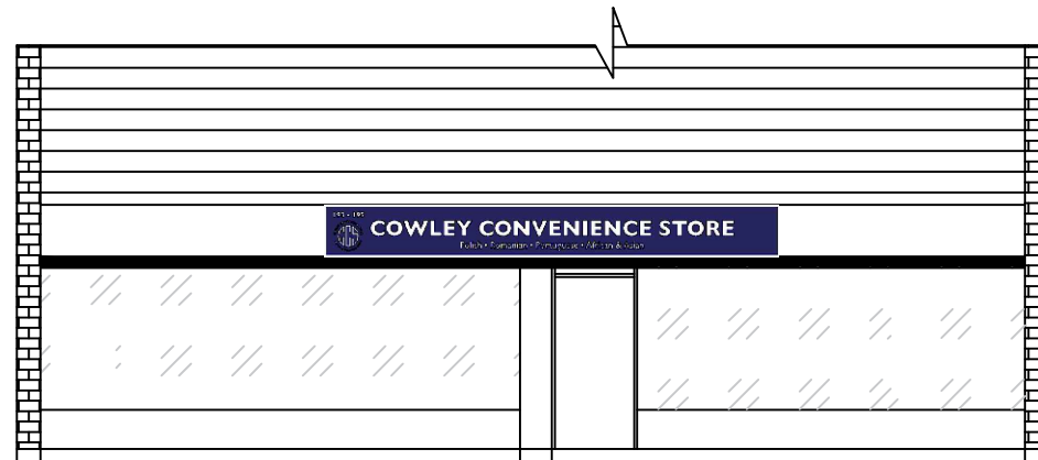
PROPOSED FRONT ELEVATION (Scale 1:100)

Measurements are indicating this drawing is only for planning purposes. If any construction work based on this drawing need to be report to the authorized person before start the work. Contractor's responsible to check the measurements on site before commencement of the work.