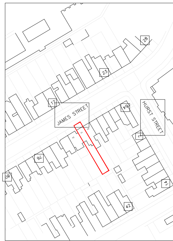
Existing Location Plan - 1:1250