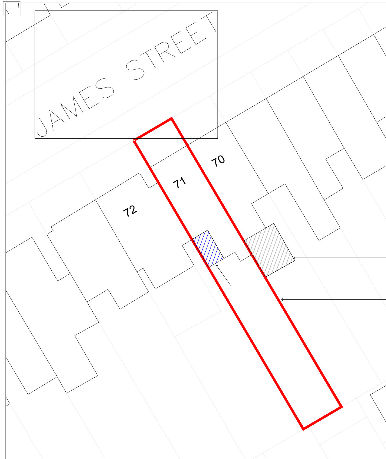
Proposed Block Plan - 1:200