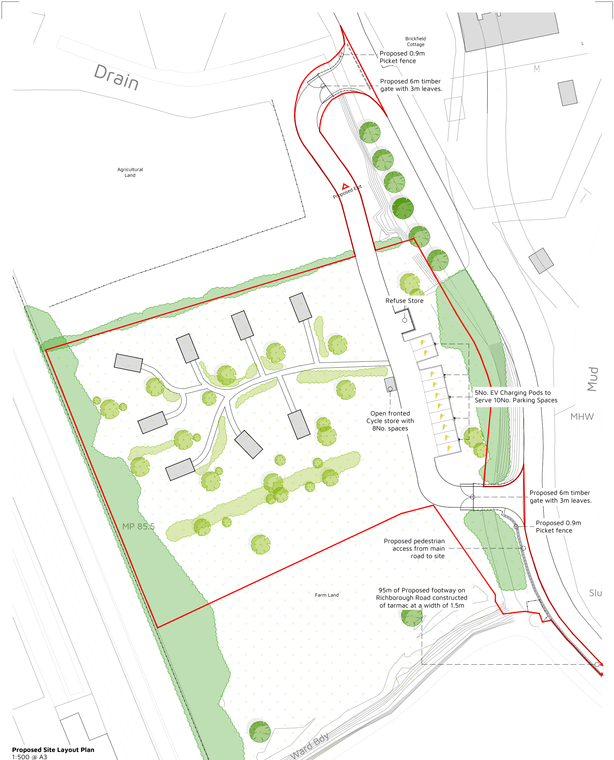
Proposed Site Layout Plan 1:500 @ A3