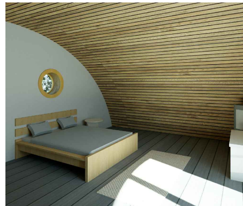
Proposed Visual 8