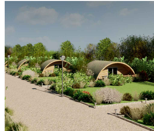
Proposed Visual 6