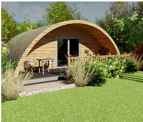
Proposed Visual 7