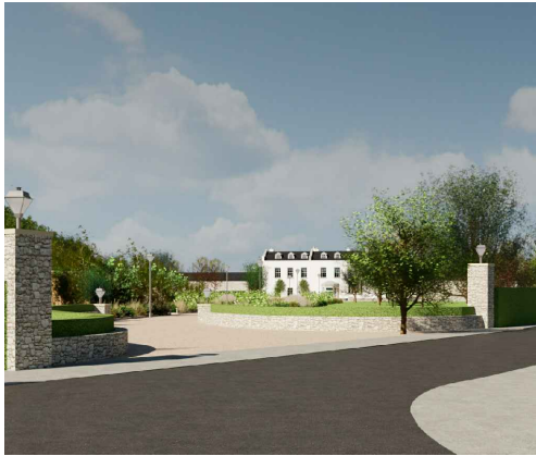
Proposed Visual 1