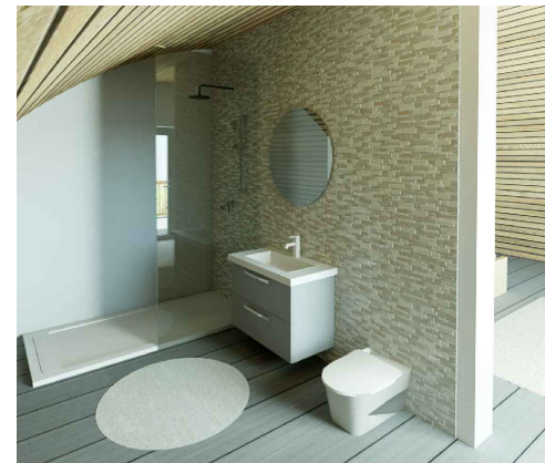
Proposed Visual 9

NOTES Do not scale from this drawing. Only figured dimensions are to be taken from this drawing. Contractor must verify all dimensions on site before commencing any work or shop drawings. Report any discrepancies before commencing work to GW Architectural. If this drawing exceeds the quantities taken in any way the practice should be informed before the work is initiated. Work within the Construction (Design & Management) Regulations 2015 is not to start until a Construction Phase Plan has been produced. All work is to be carried out in accordance with good building practice and any relevant legislation, British Standards, Codes of Practice, etc. in force at the time of the execution of the works. This Drawing is Copyright and must not be reproduced without consent of GW Architectural Drawing Status/Type Key: F - Feasibility stage drawing P - Planning stage drawing T - Tender stage drawing C - Construction stage AB - As Built Status TNT - Tenant drawing SK - Sketch drawing M - Marketing drawing L - Landscape Drawing S - Survey drawing OS - Ordnance Survey drawing Rev. Description Drawn Date Ch'ked Date