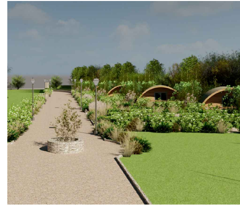
Proposed Visual 3