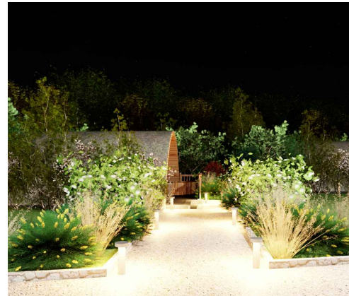
Proposed Visual 5