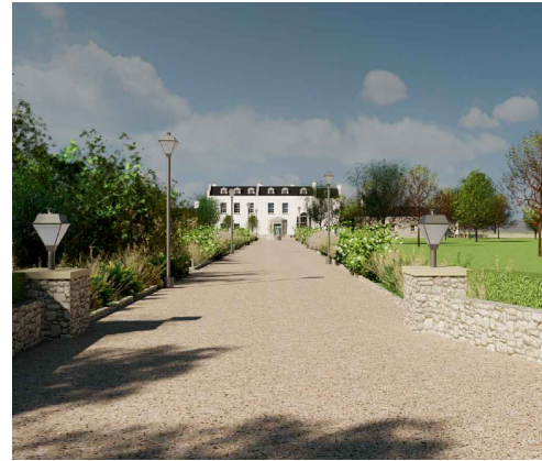
Proposed Visual 2