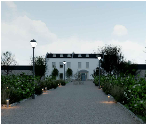
Proposed Visual 4