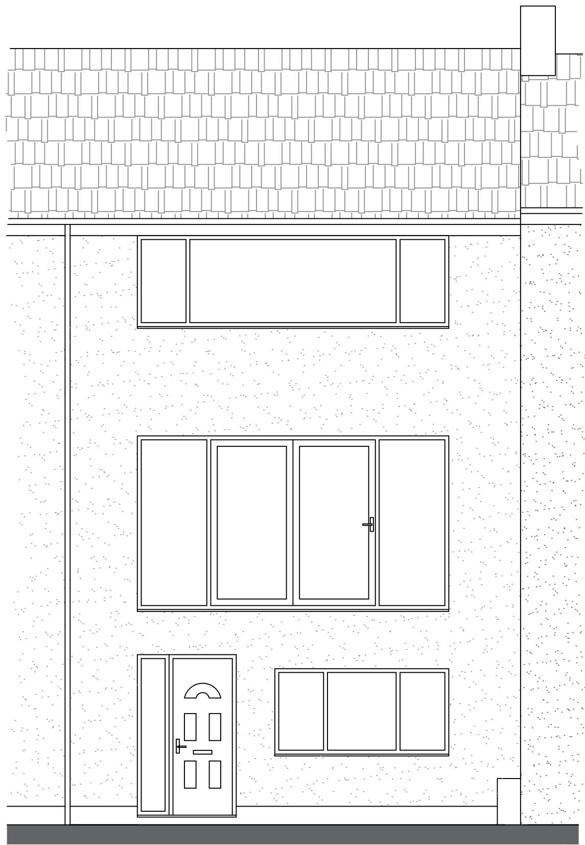
Existing Front Elevation Scale 1:50