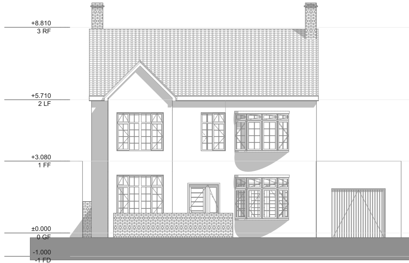
1 Front Elevation 1:100