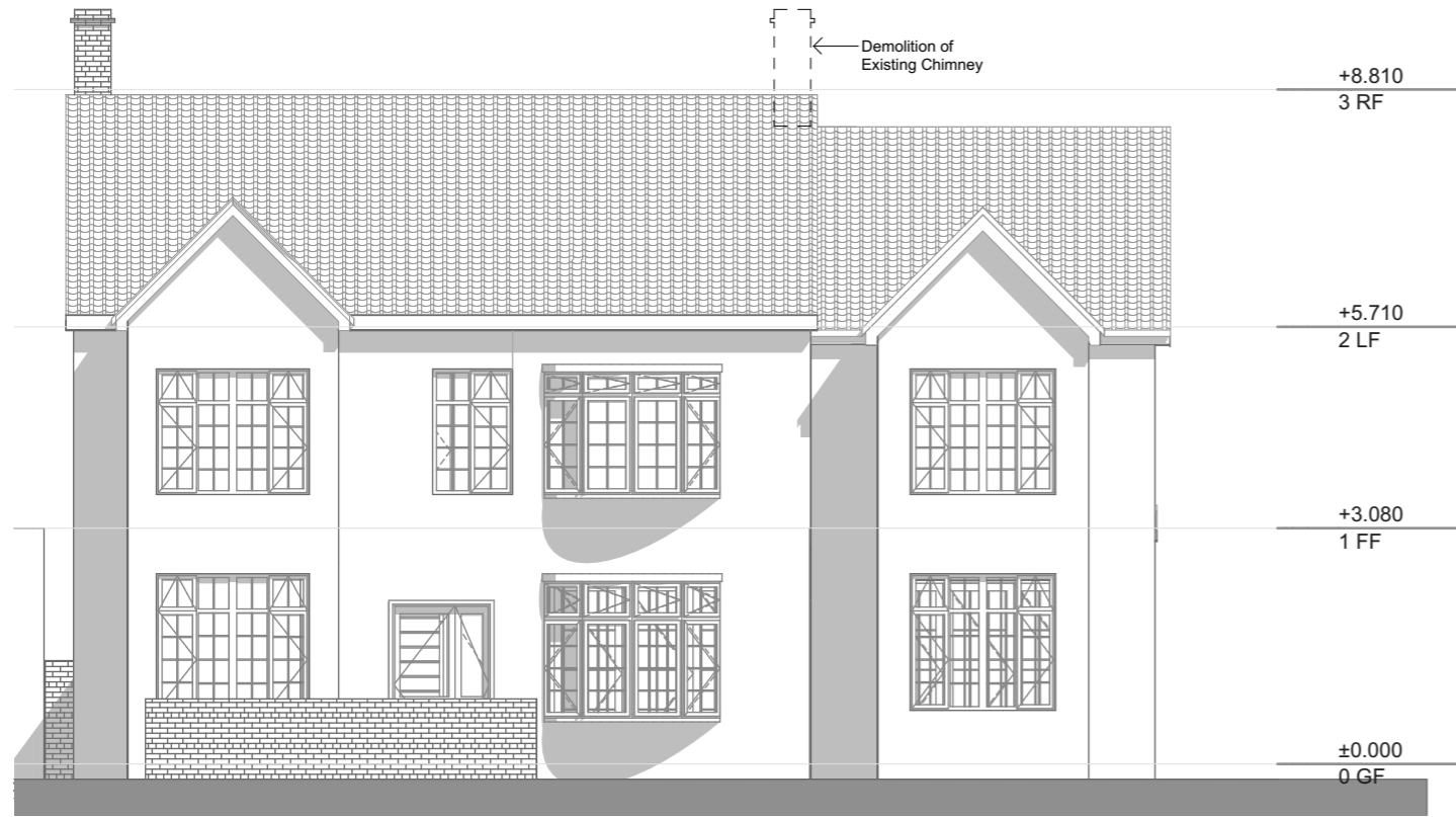
1 Front Elevation 1:100