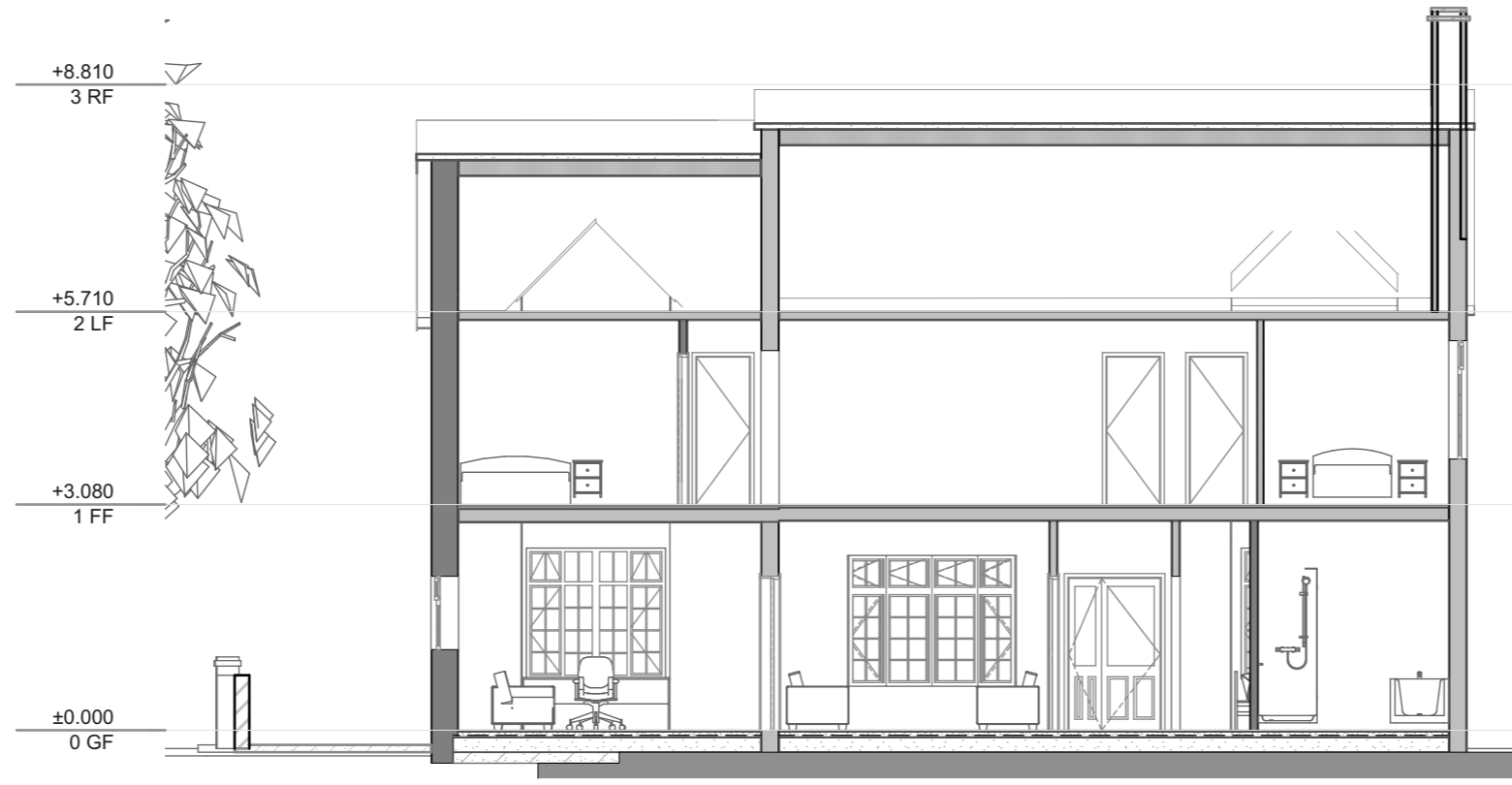
1 Building Section S-01 1:100