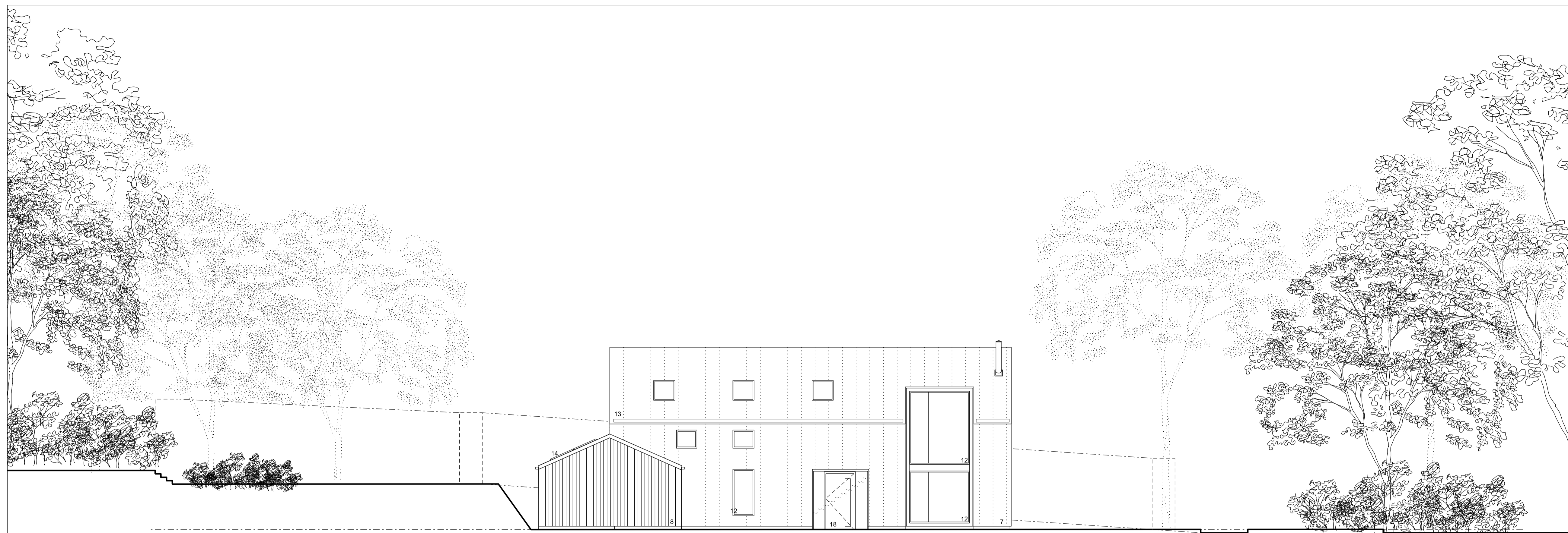
North East Elevation - internal to site