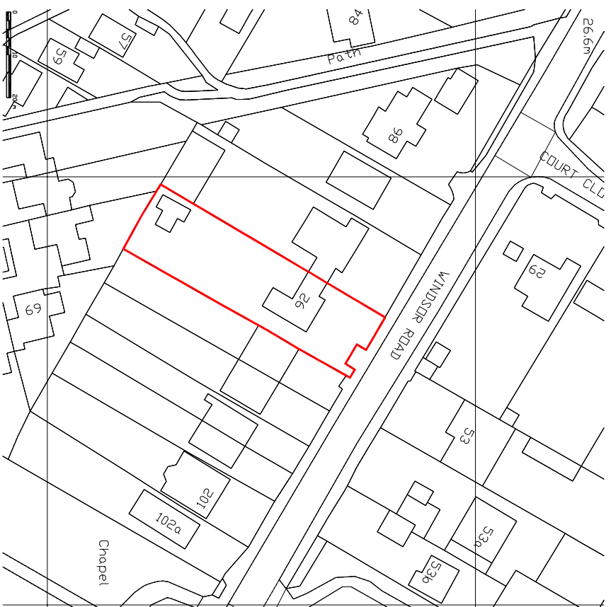
Location Plan (1:1250) Supplied by Streetwise Maps Ltd Licence No: 100047474