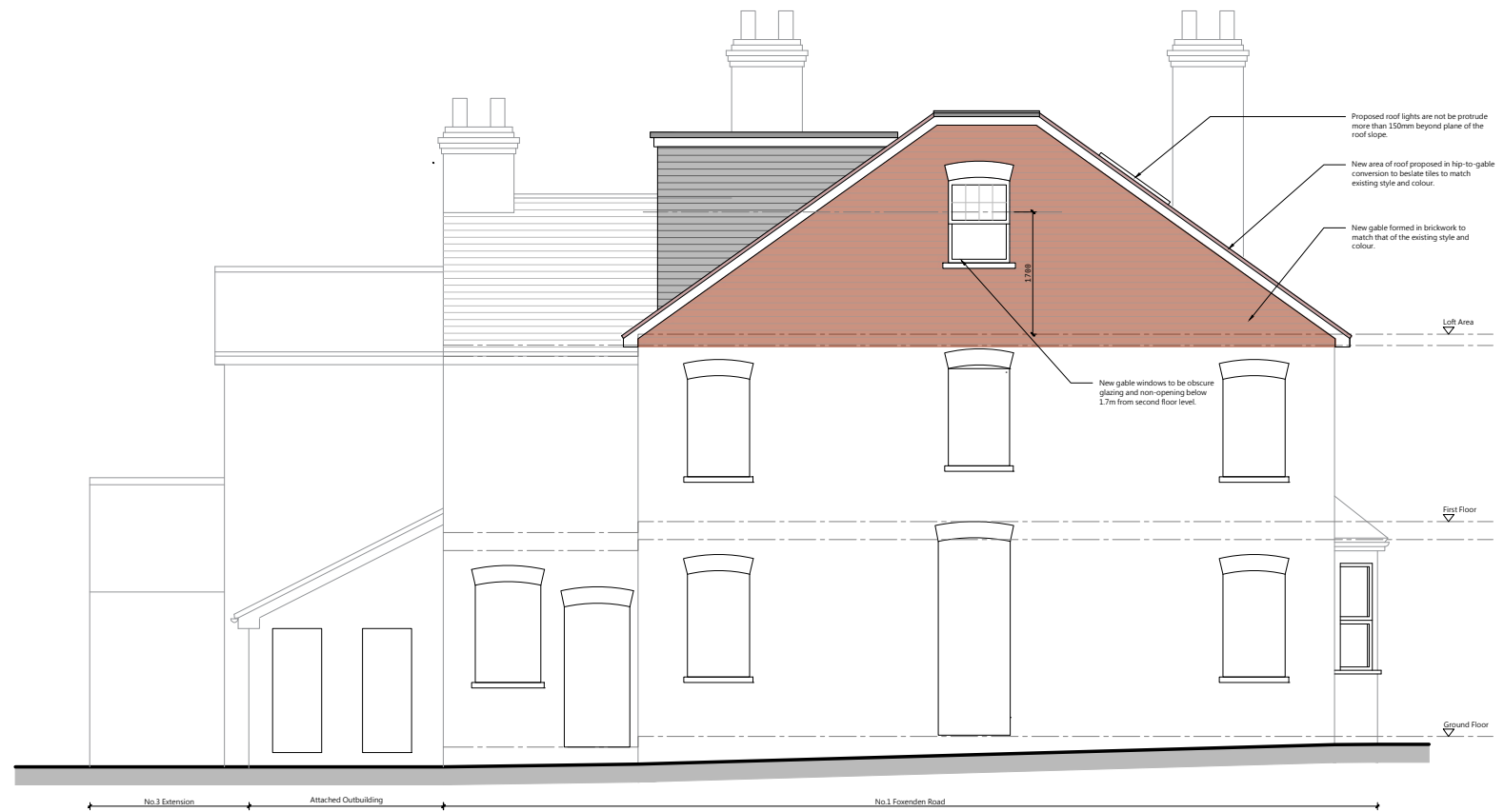
Side (South) Elevation Scale 1:100 @ A3