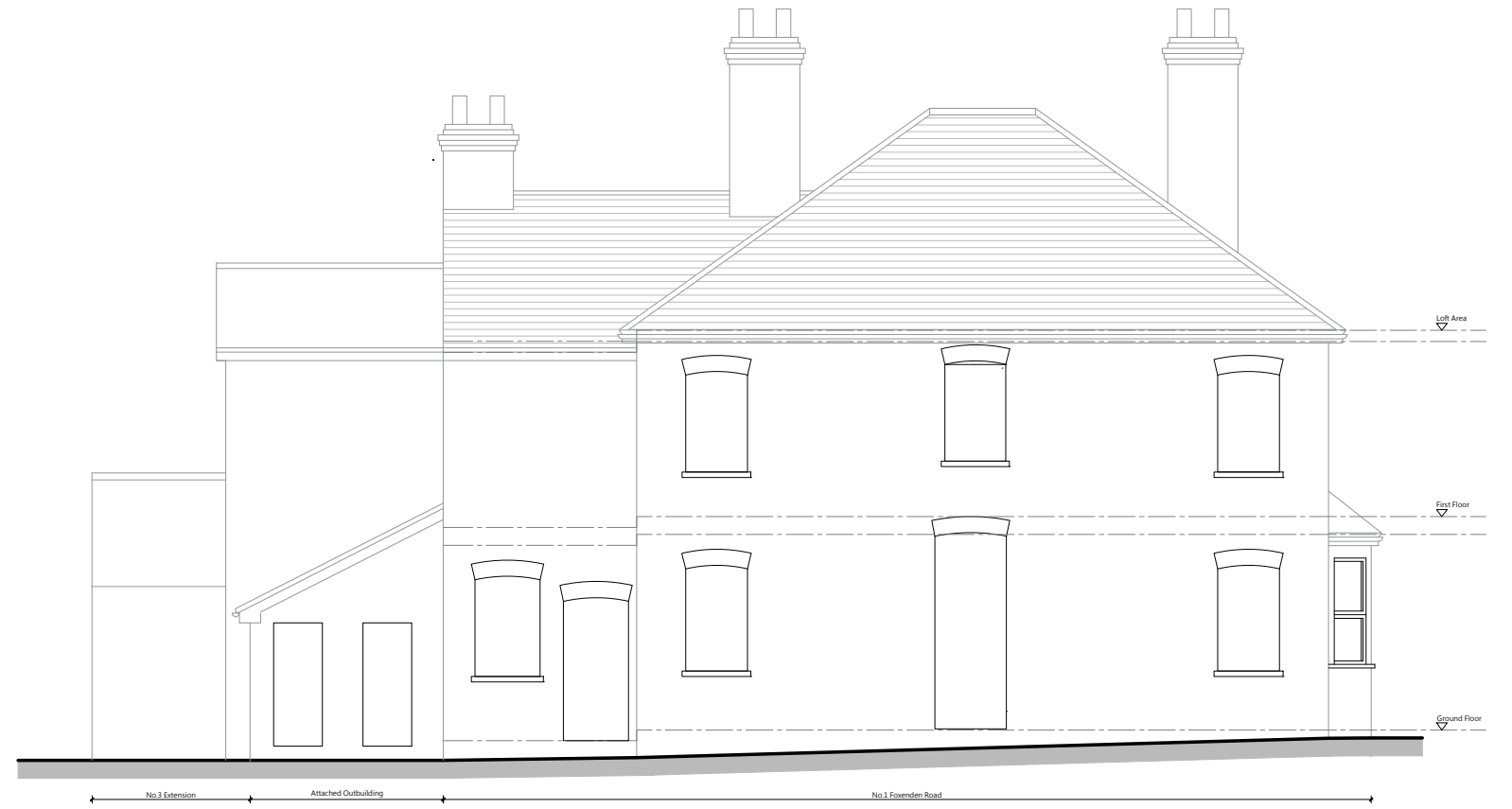
Side (South) Elevation Scale 1:100 @ A3