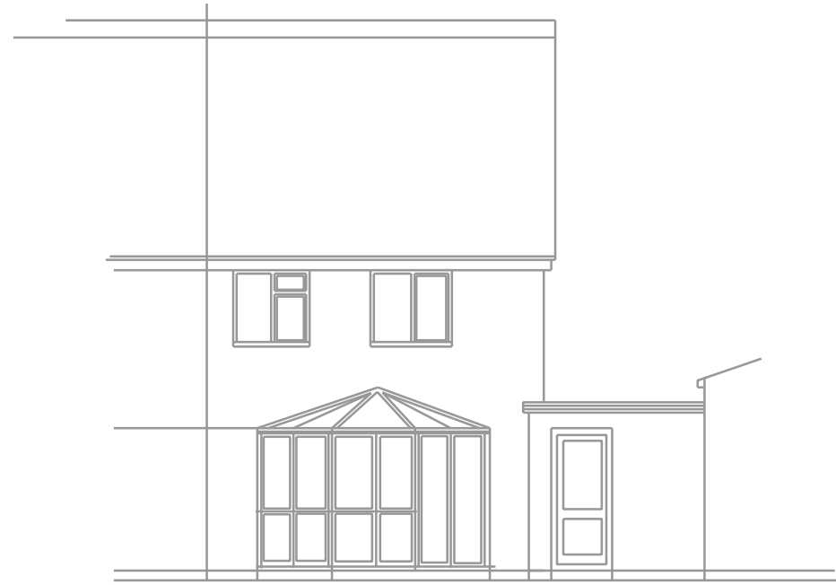
REAR ELEVATION - EXTG