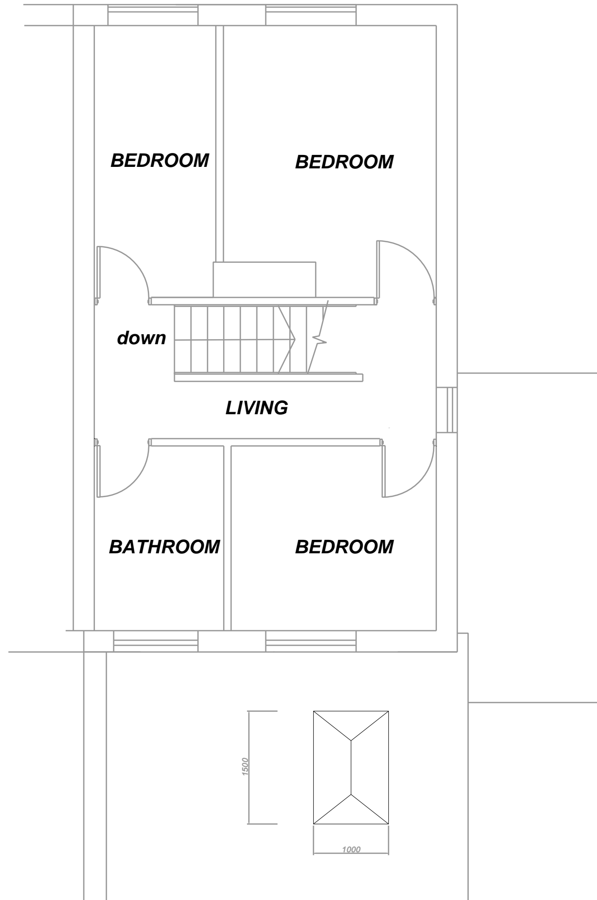
FIRST FLOOR PLAN - PROP