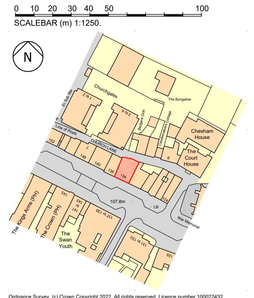
SITE & LOCATION PLAN (SCALE 1:1250)