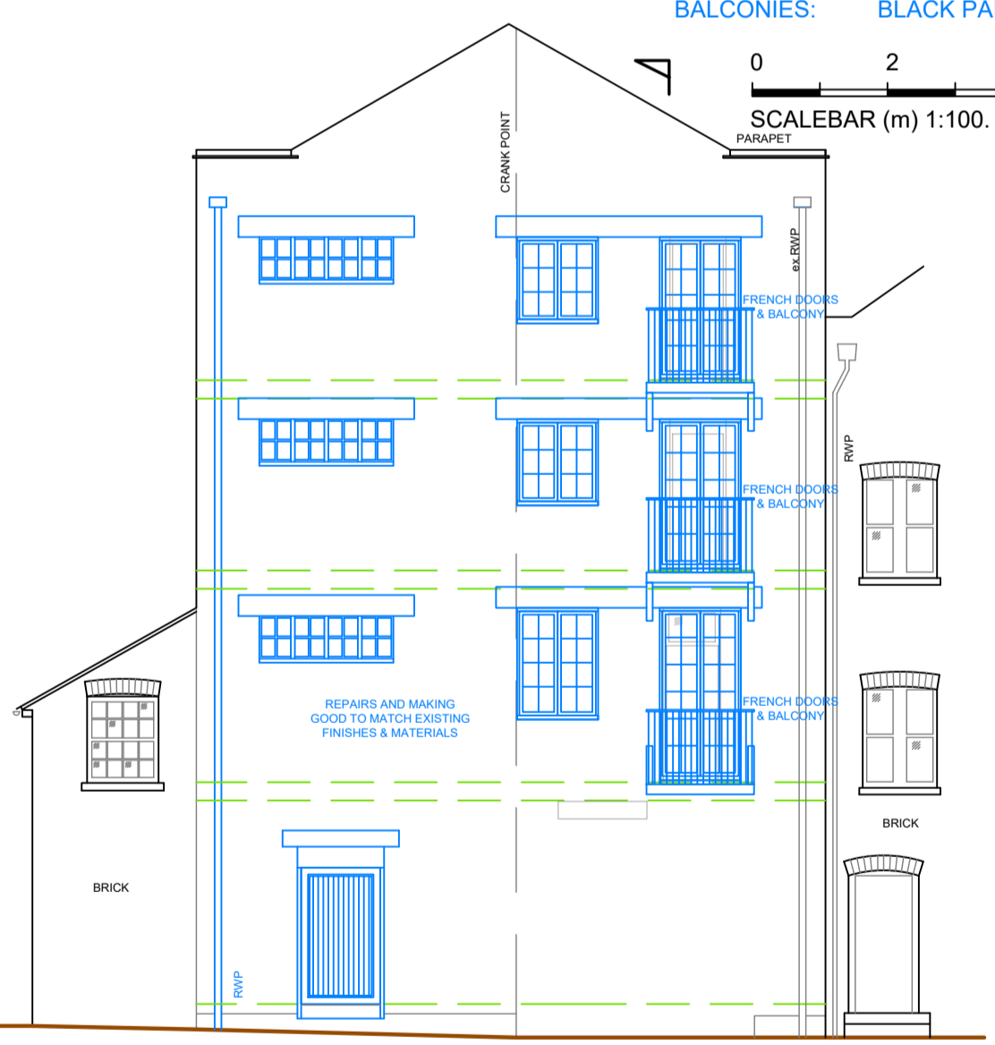
CHURCH LANE ELEVATION (SCALE 1:100)