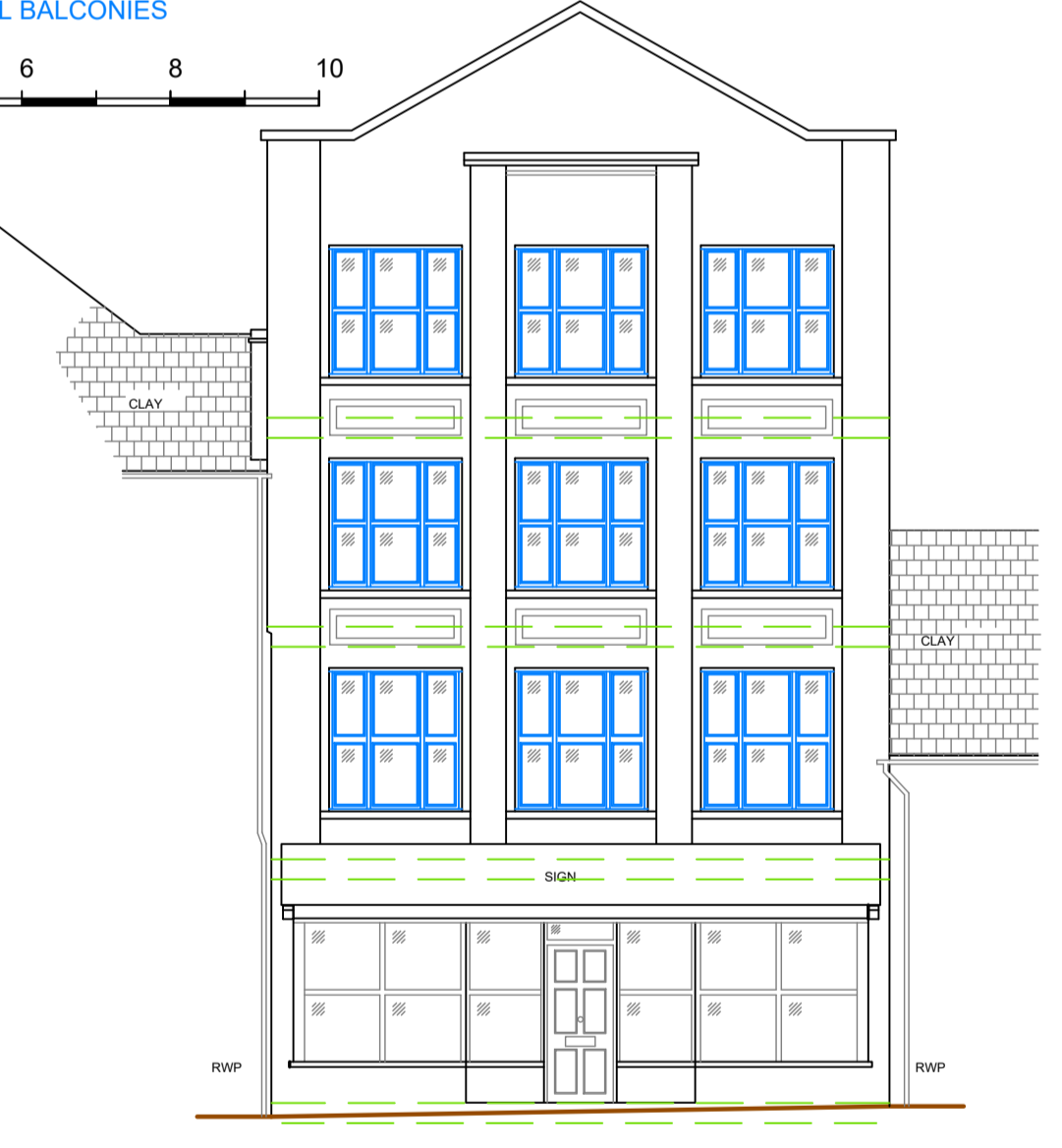
HIGH STREET ELEVATION (SCALE 1:100)