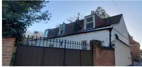
2 Rear – north aspect