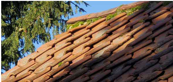
5 Gaps under tiles