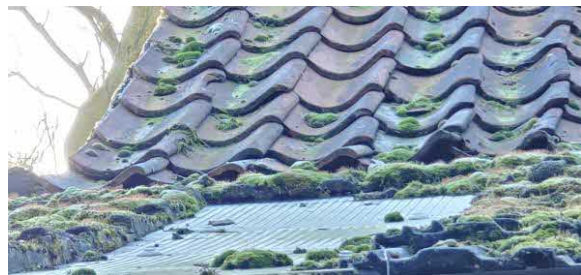
8 Gaps under tile runs between main roof and extension