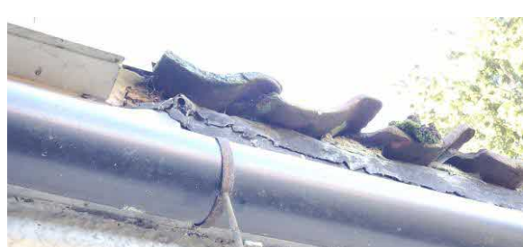
6 Gaps at end of tile runs