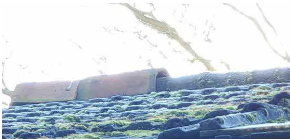
7 Ridge tiles placed to cover broken cement tiles