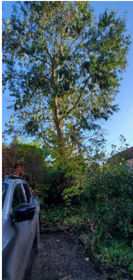
10 Eucalyptus tree