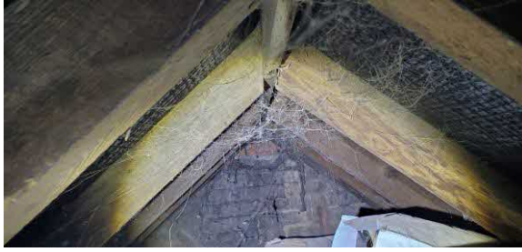
9 View inside small loft