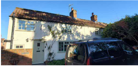
1 Front – south aspect