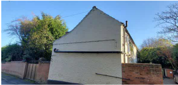
3 Side – west aspect