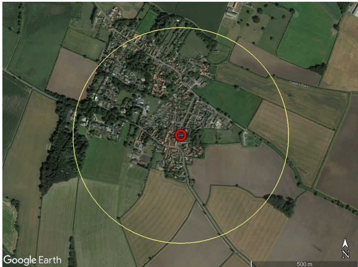
Figure 1 – Site Location

The habitats in the area are suitable for foraging and commuting bats.