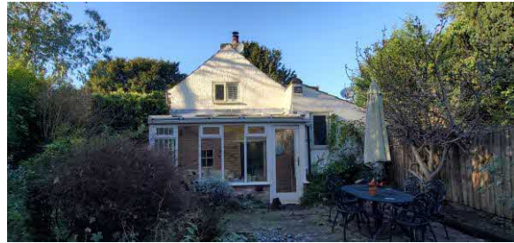
4 Side – east aspect