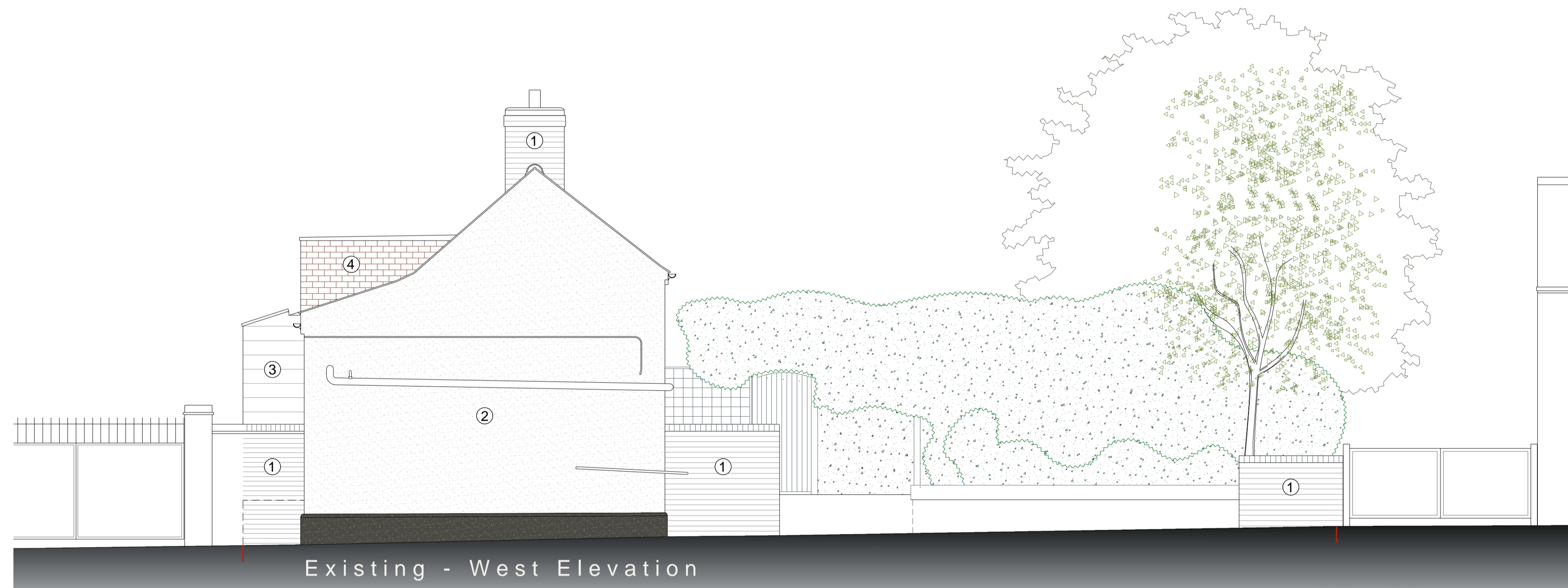
Existing - West Elevation