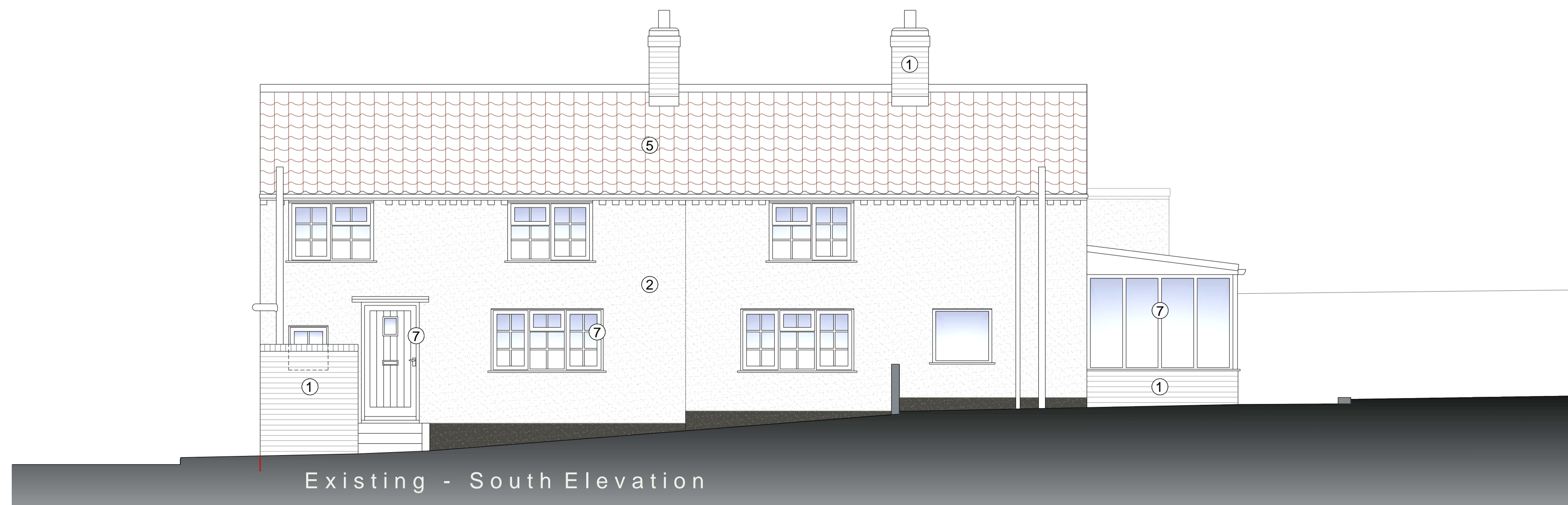
Existing - South Elevation