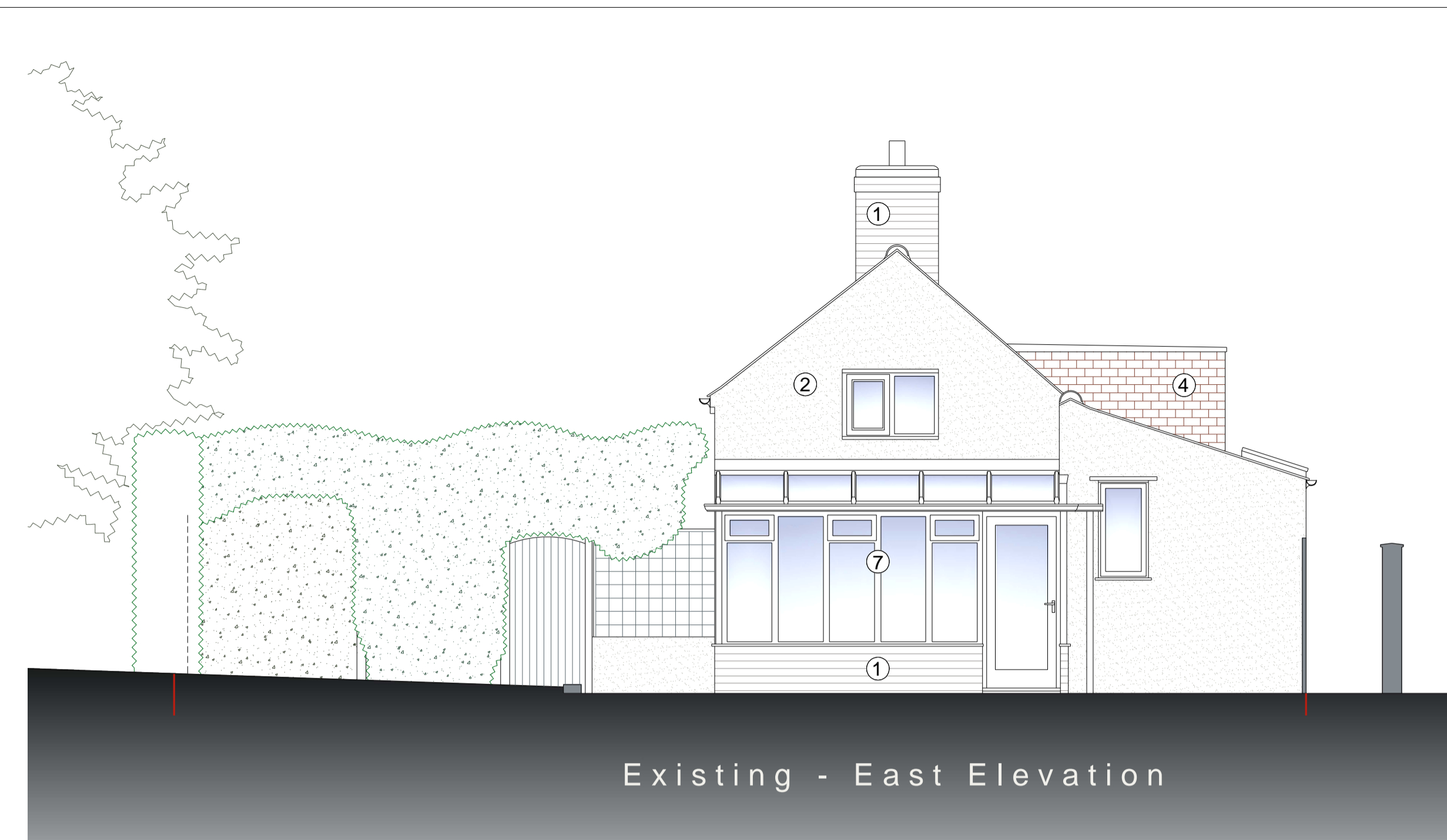
Existing - East Elevation