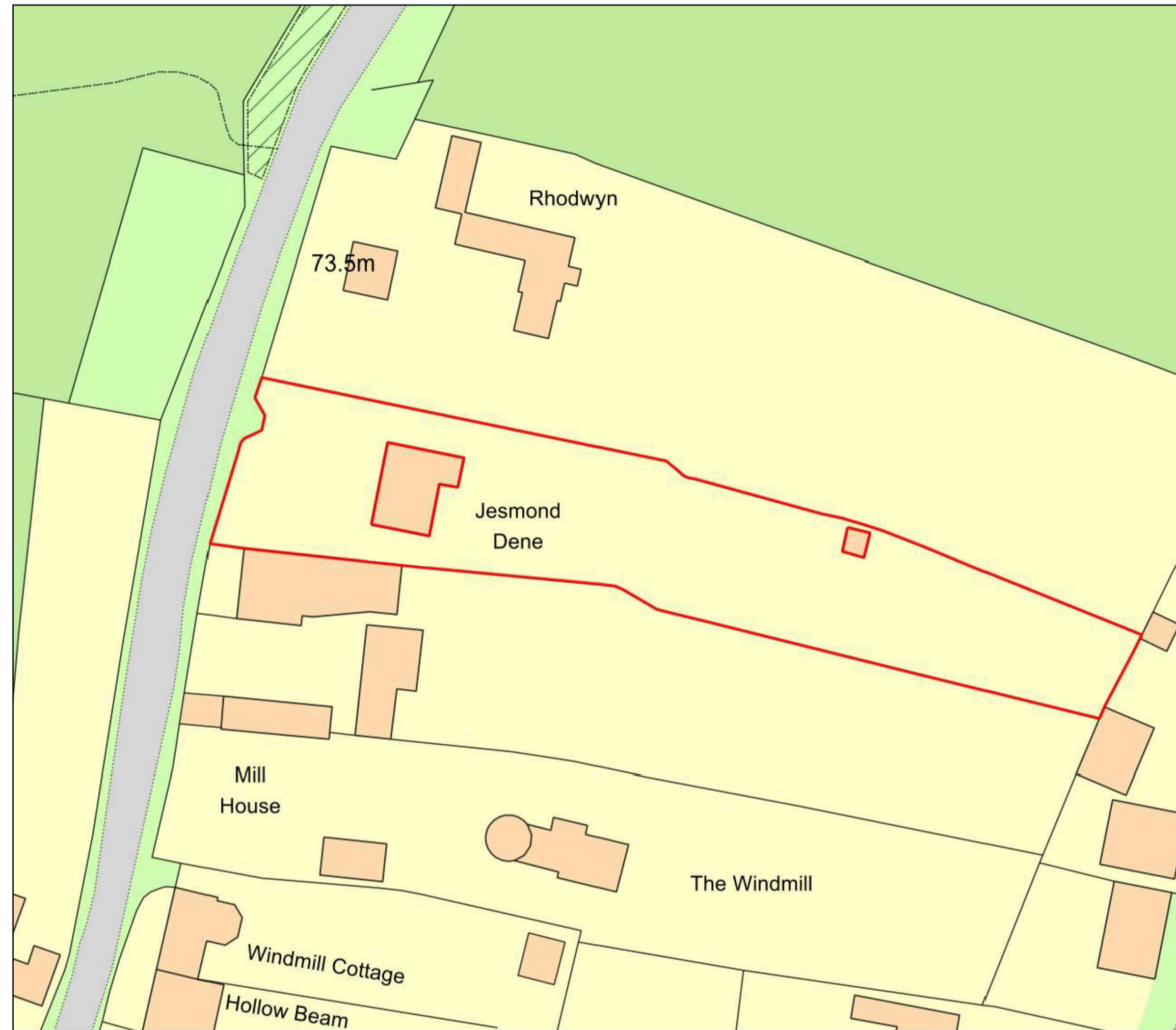
Existing Site Plan 1 : 500