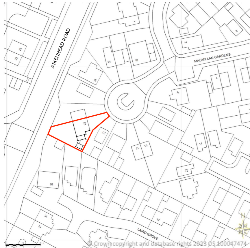
P :: LOCATION PLAN 16 scale: 1:1250