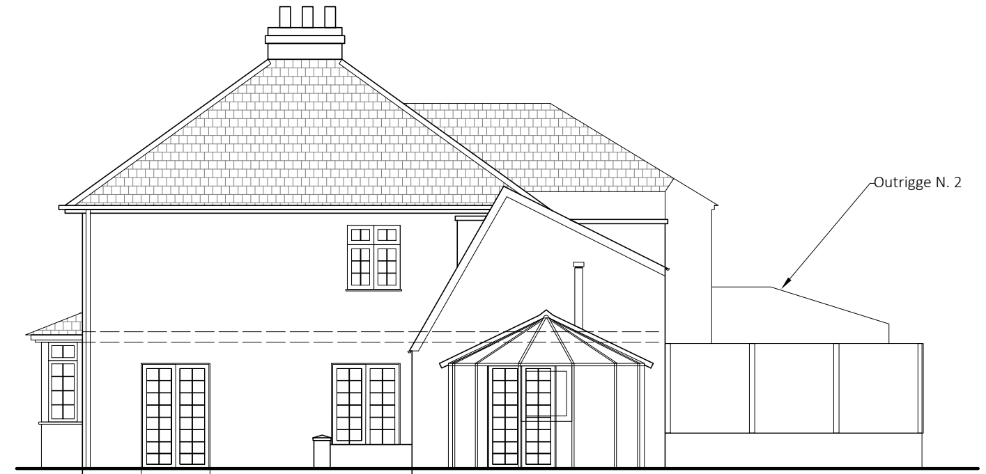
EX: SIDE ELEVATION