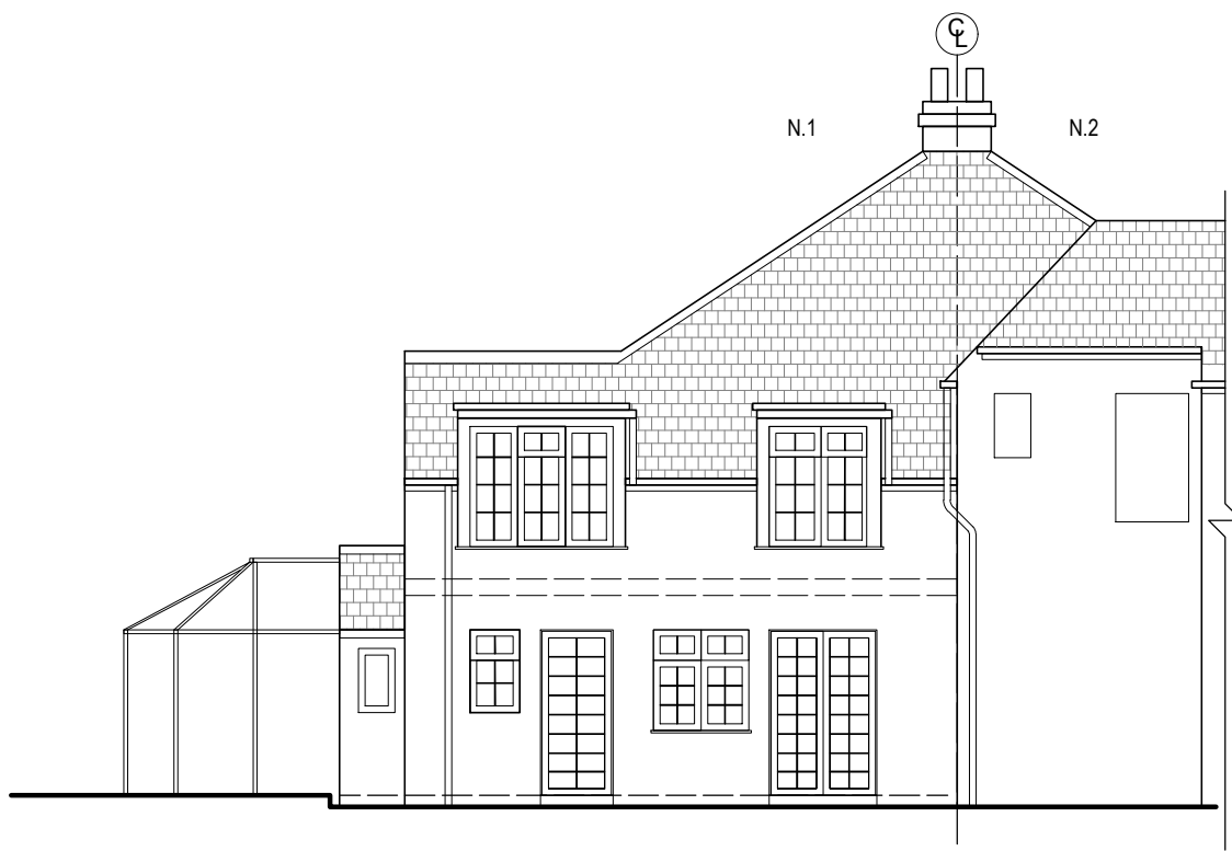
EX. REAR ELEVATION