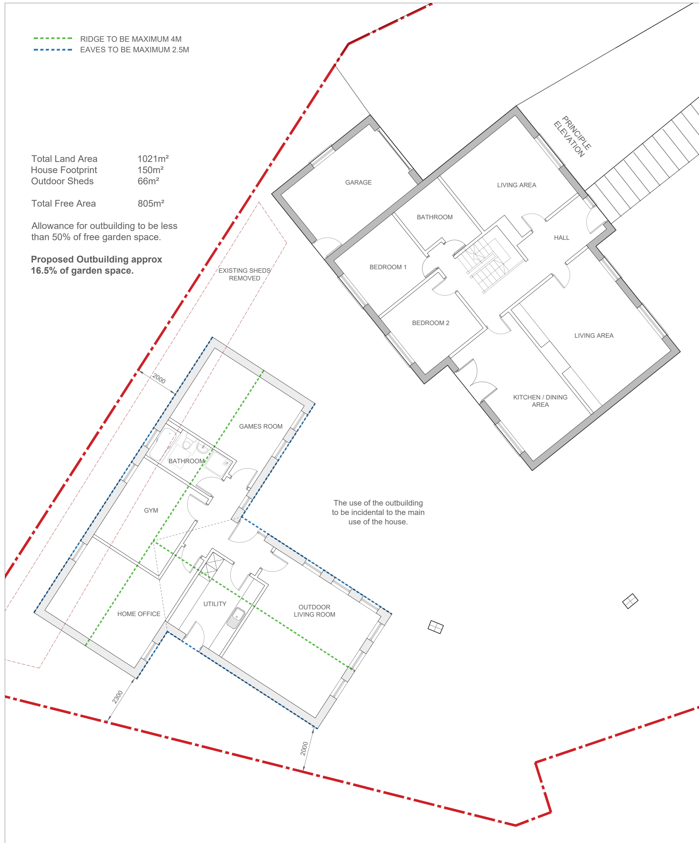
PROPOSED OUTBUILDING 1:100