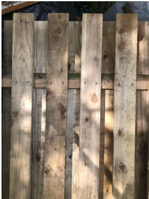
Hit and miss vertical slat construction