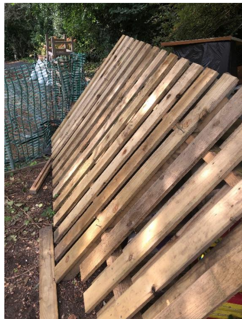
View of finished face (both faces the same)