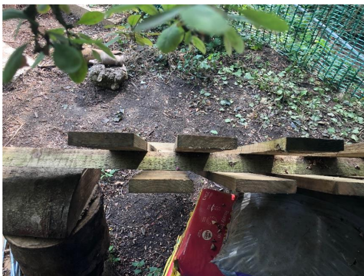
Plan view of vertical slats on both faces of cant rails showing hit and miss style