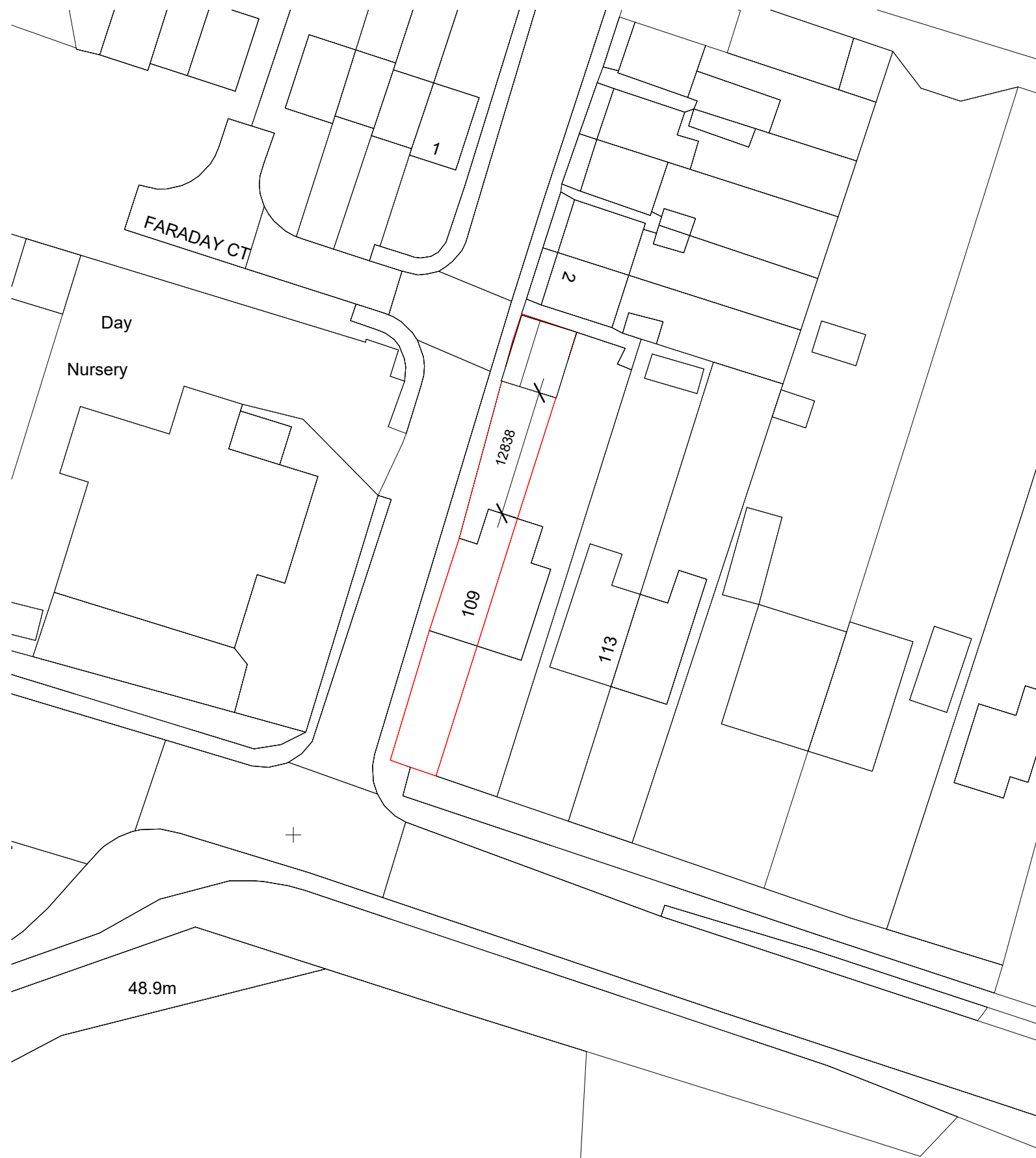
1 Block Plan 1 : 500