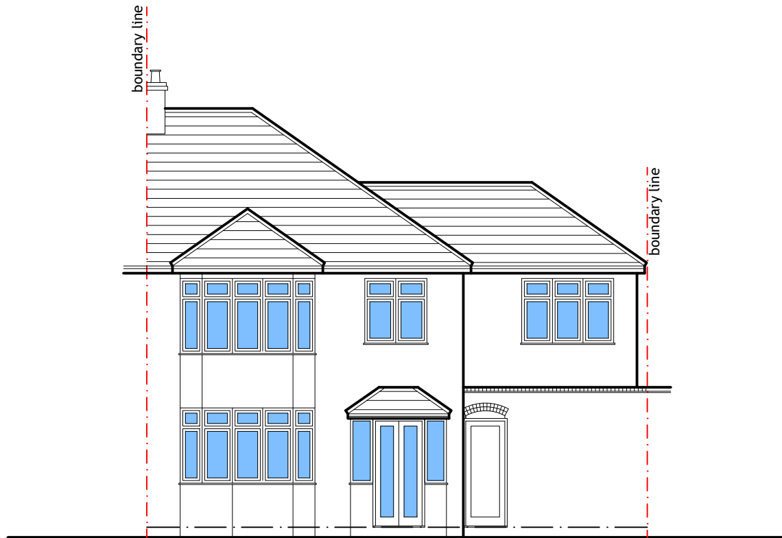
existing front elevation