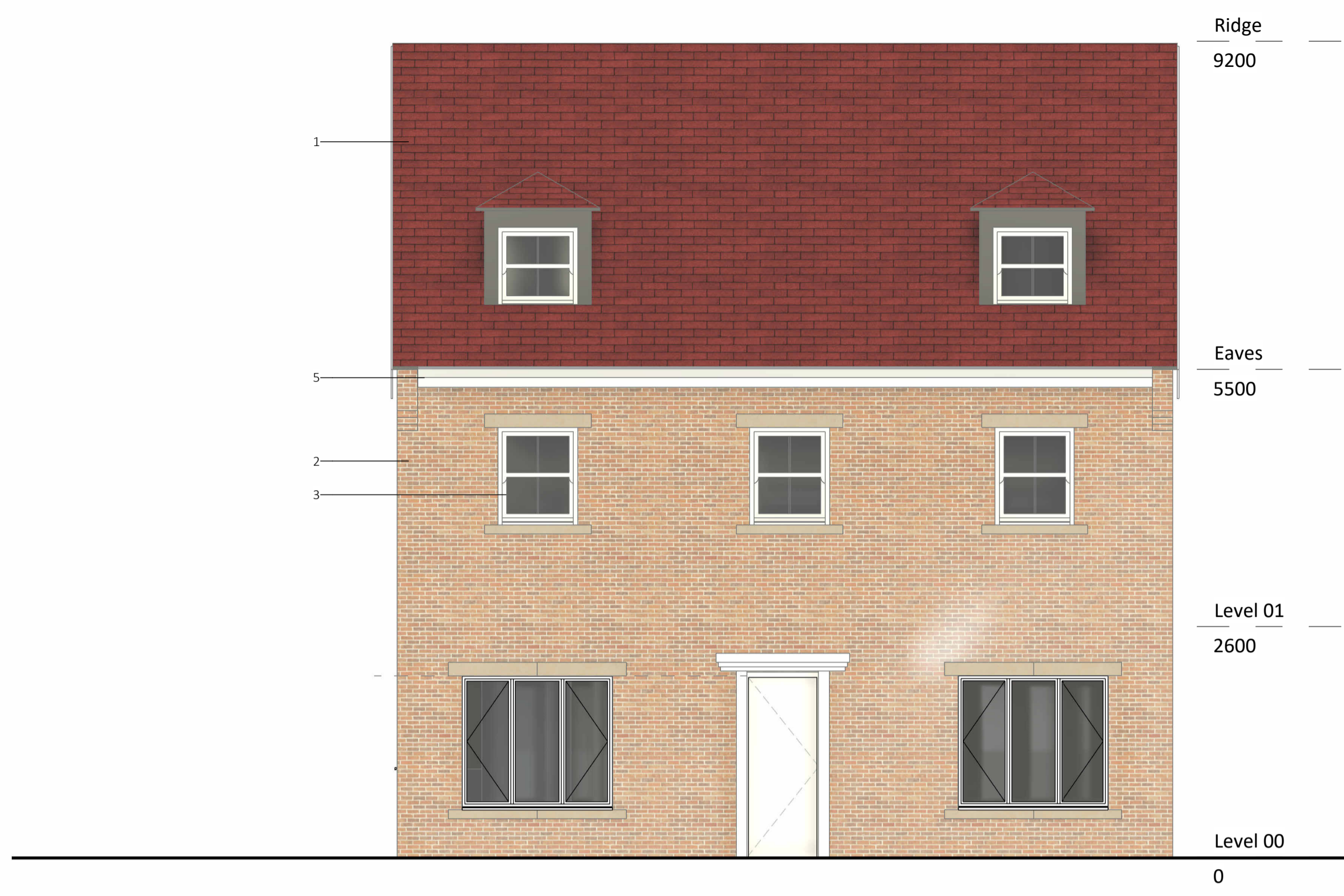
North as existing 1 : 50