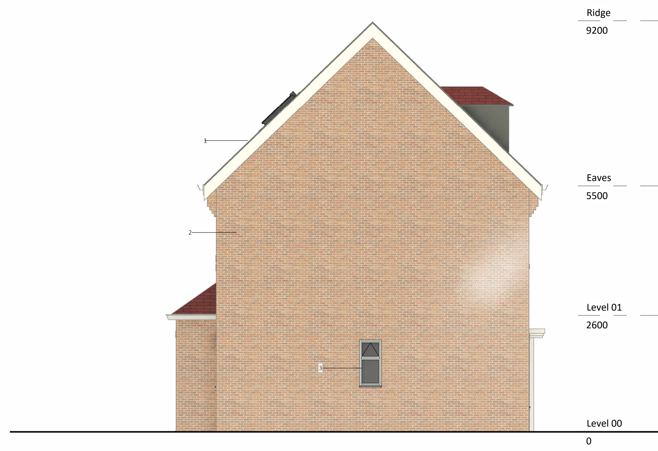
East as existing 1 : 50