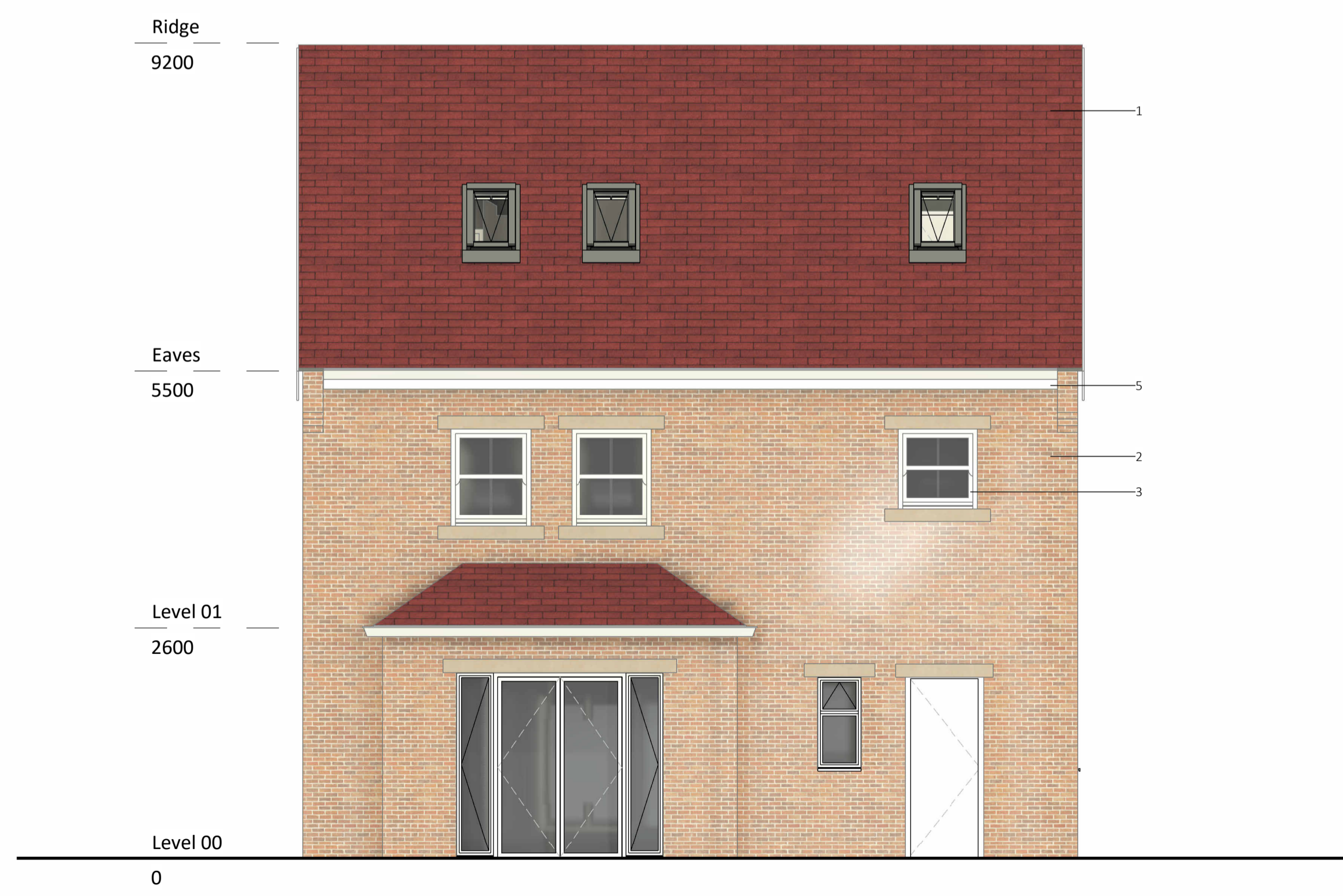
South as existing 1 : 50