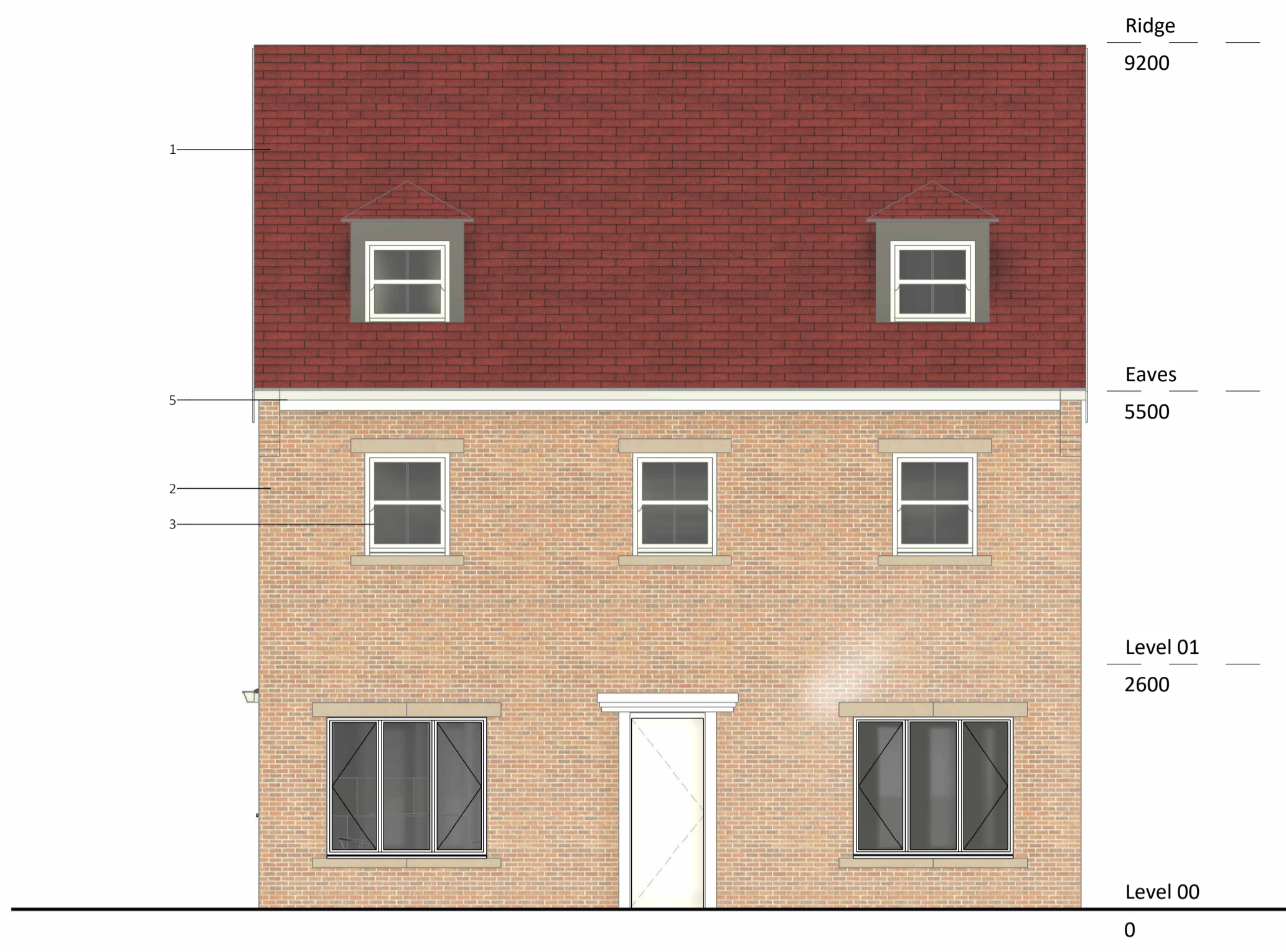
North as proposed 1 : 50