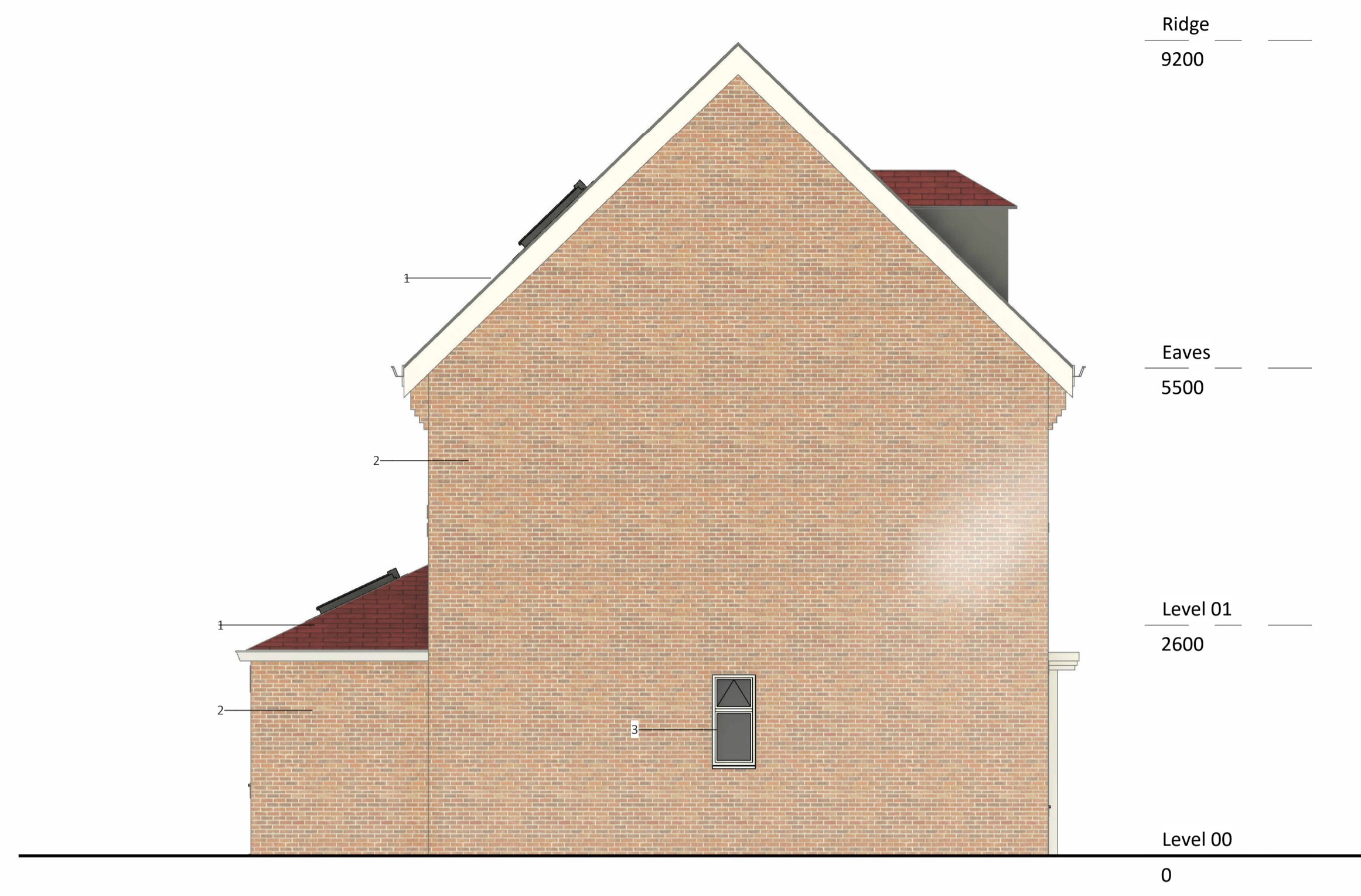
East as proposed 1 : 50