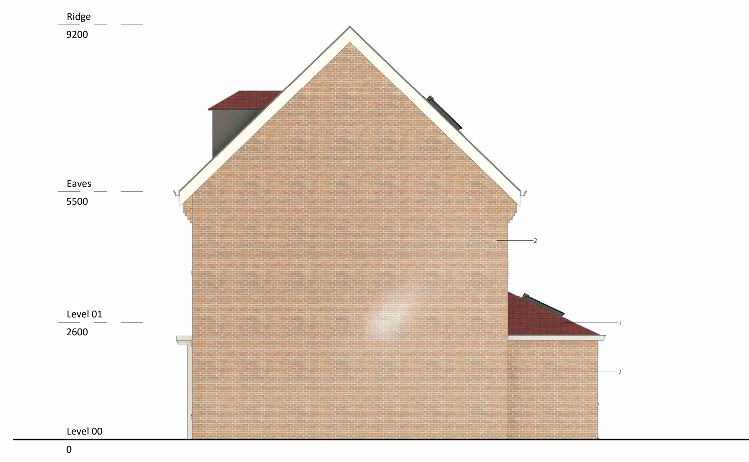
West as proposed 1 : 50