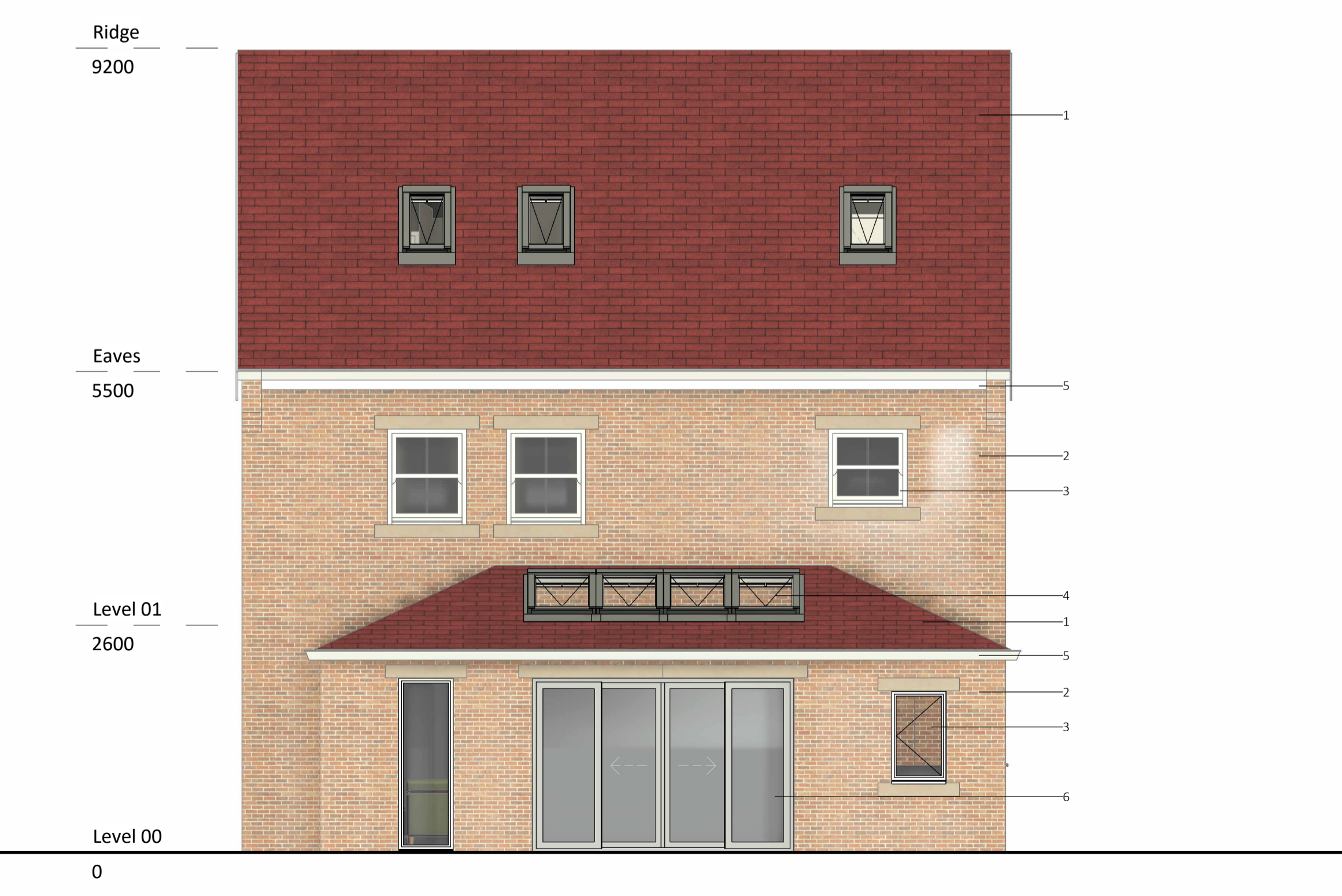
South as proposed 1 : 50