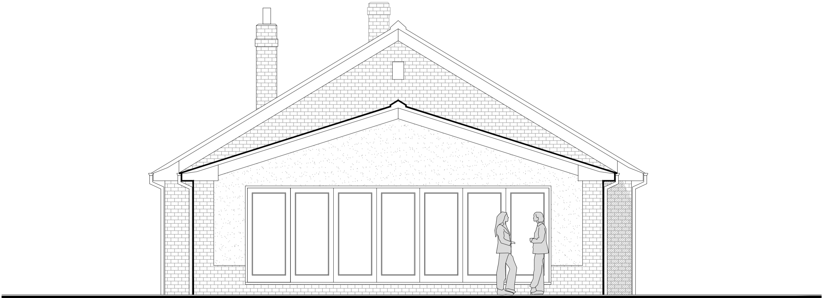
Proposed Side Elevation 1:50