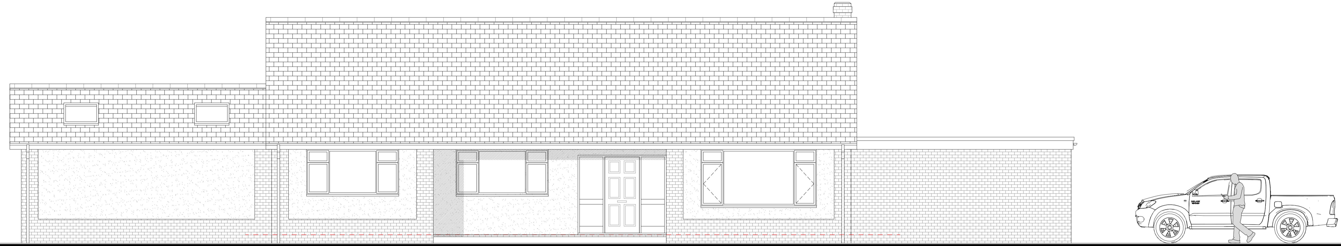
Proposed Front Elevation 1:50