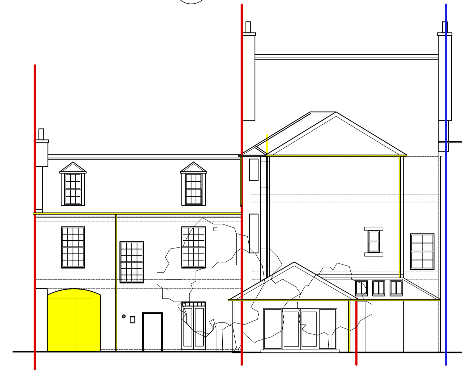
6 Proposed South Elevation Scale: 1:100