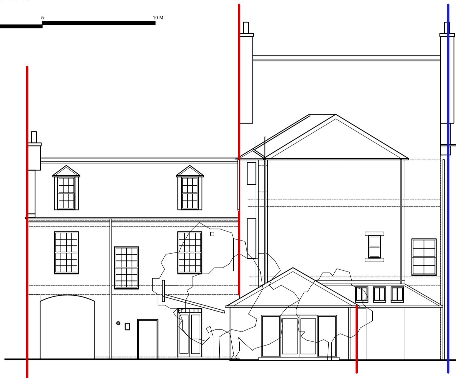
6 Existing South Elevation Scale: 1:100