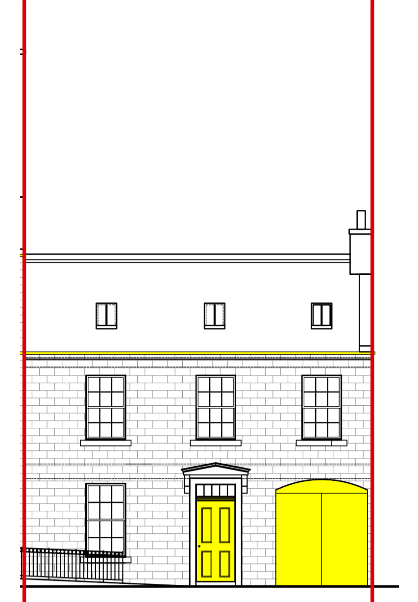
4 Proposed Street (North) Elevation Scale: 1:100