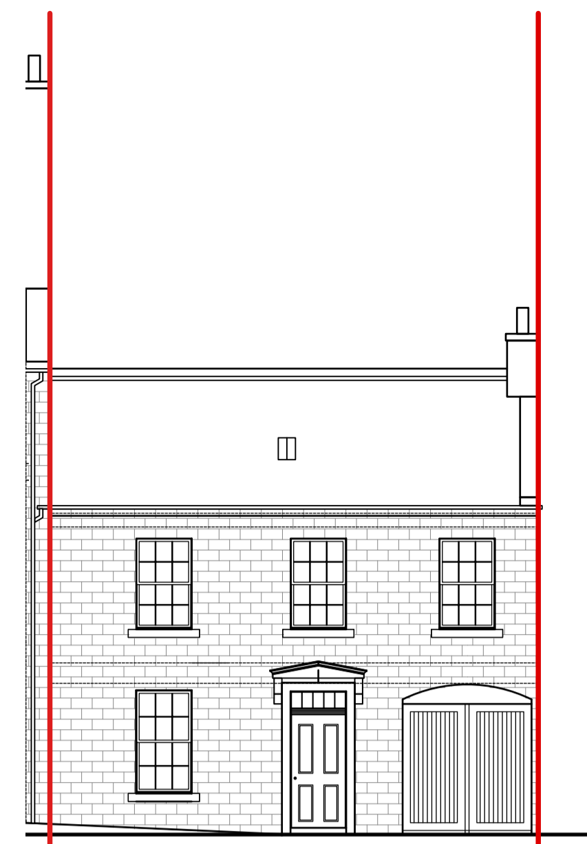
4 Existing Street (North) Elevation Scale: 1:100