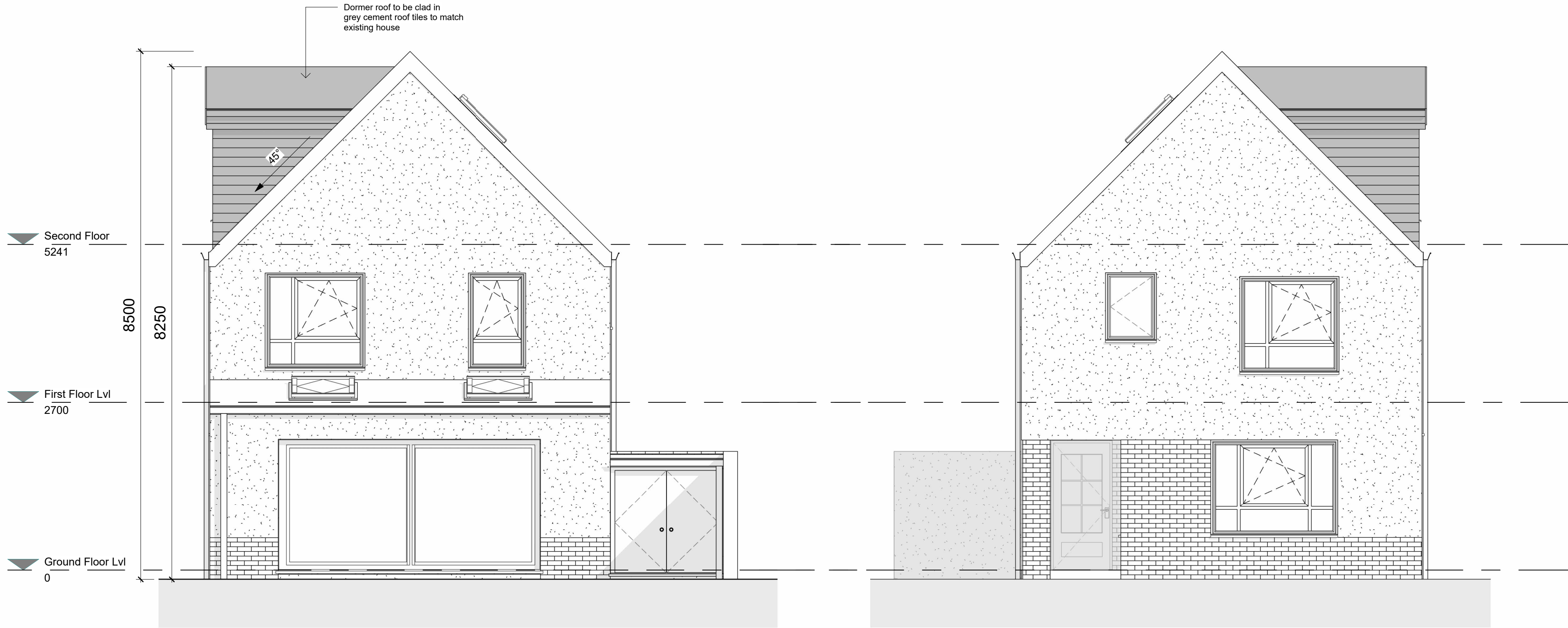
PL - Proposed South 1 : 50