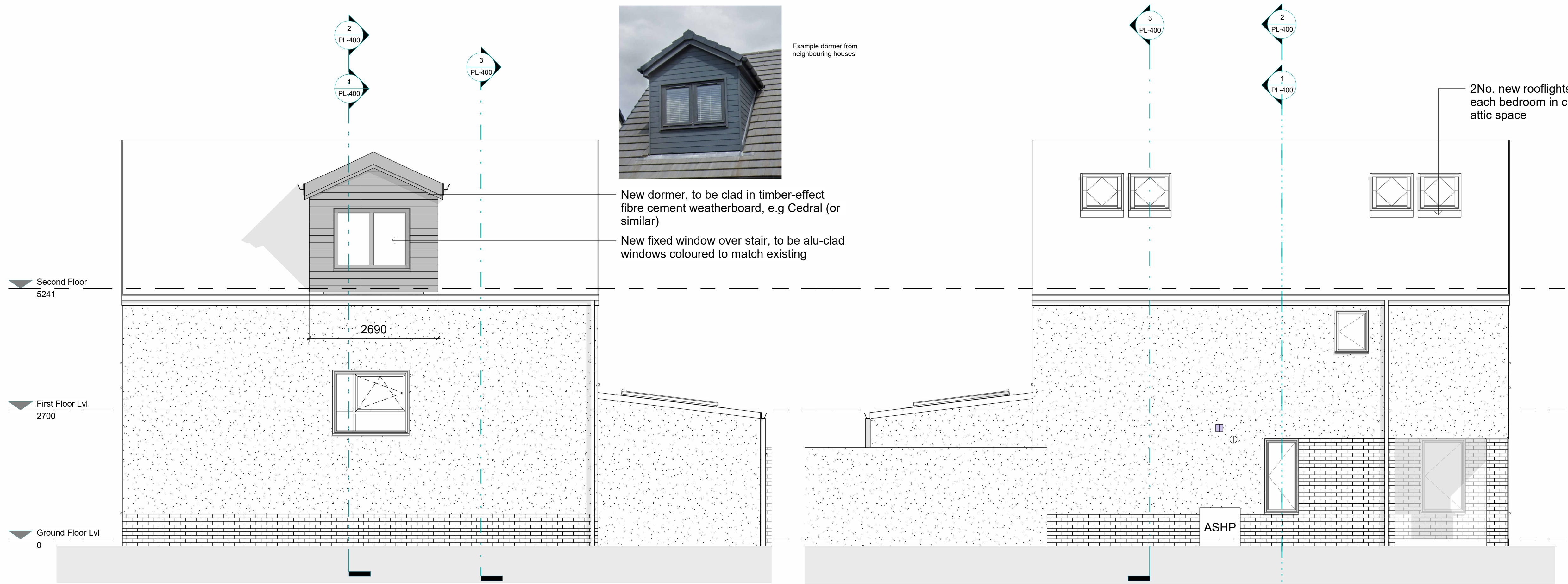
PL - Proposed West 1 : 50