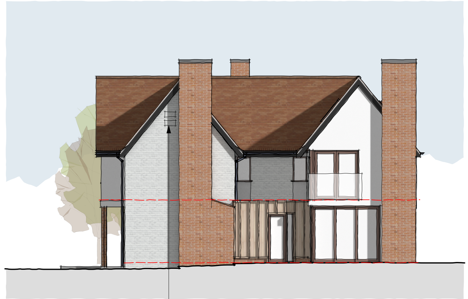
REAR ELEVATION Scale: 1:100

2 no. intergrated manthorpe swift boxes to underside of overhanging roof located minimum 5m off ground on north east elevation.