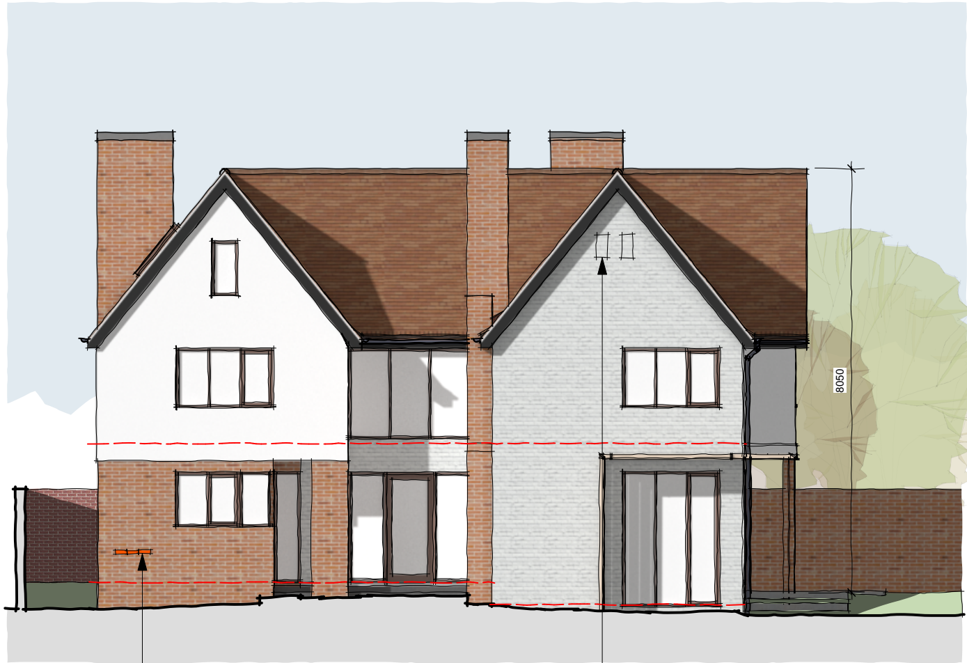
FRONT ELEVATION Scale: 1:100

3 no. bee bricks minimum 1m above the ground