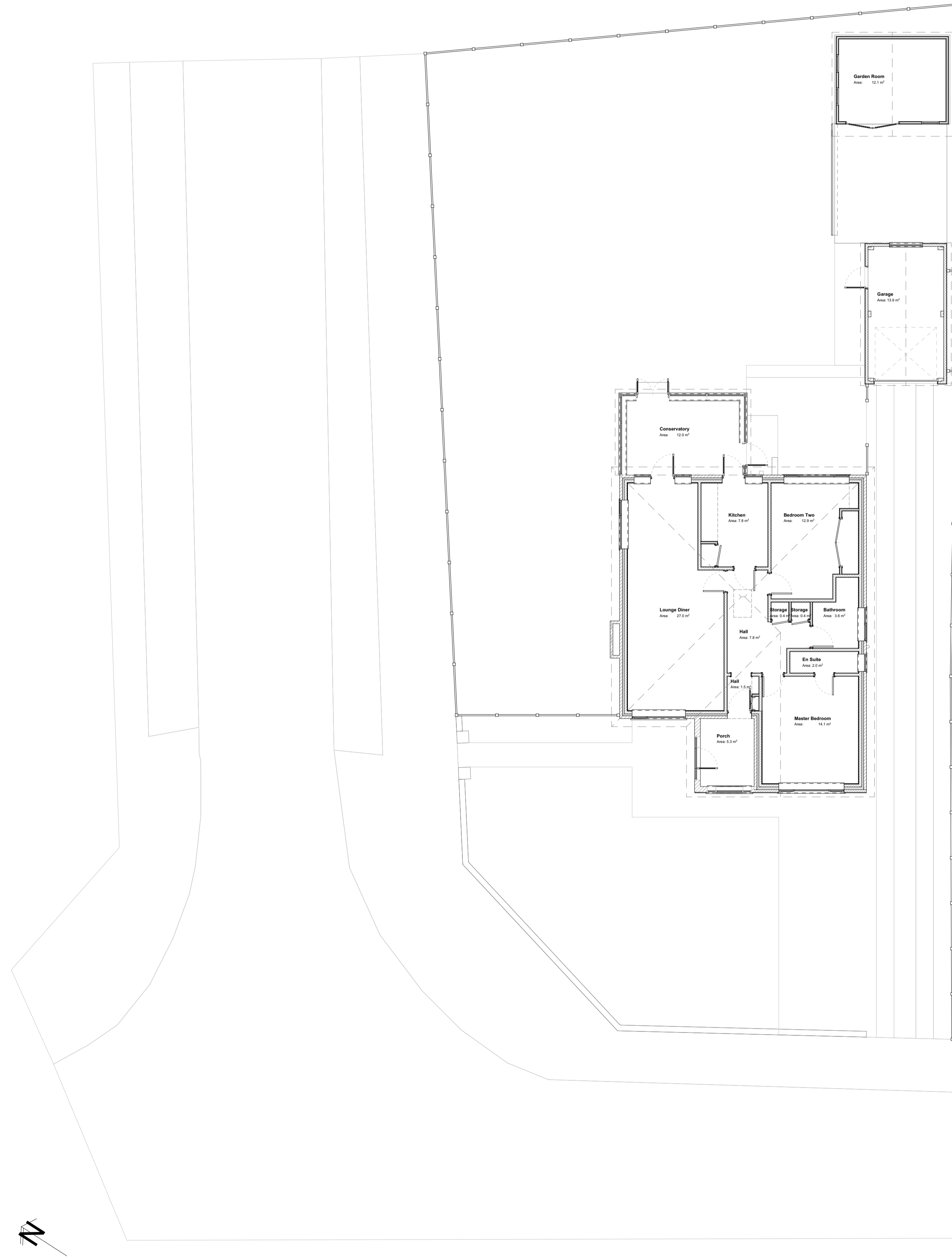
Site Plan as Existing 1:100