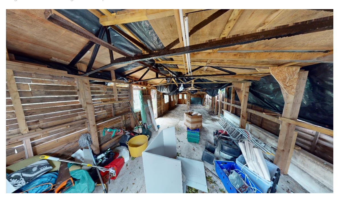
Figure 4 Existing Outbuilding