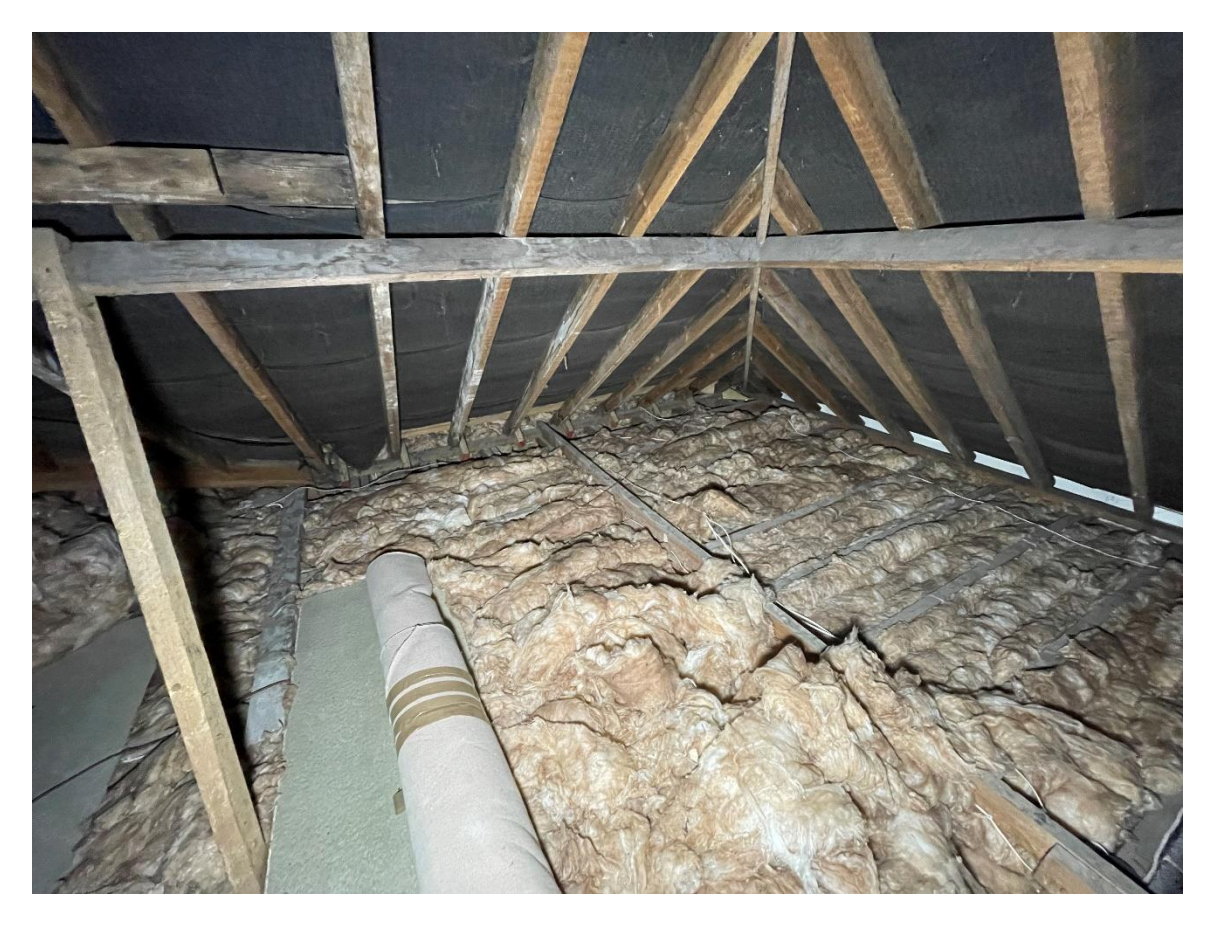
Figure 3 Existing Loft Space