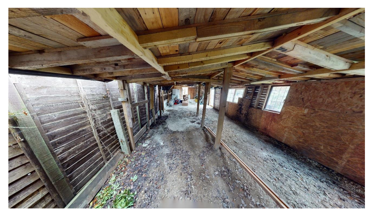
Figure 2 Existing Outbuilding