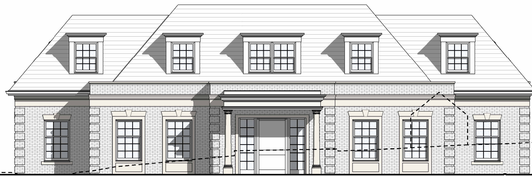
Front Elevation - Rear Building 1 : 100