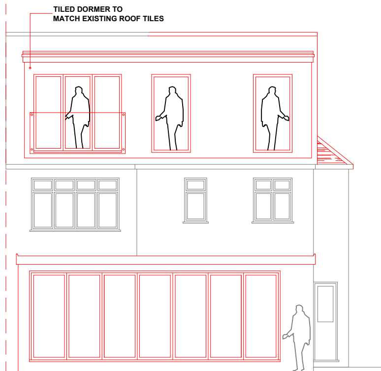
PROPOSED REAR ELEVATION Scale 1:100@A3