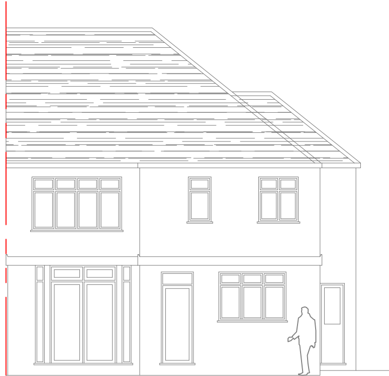
EXISTING REAR ELEVATION Scale 1:100@A3