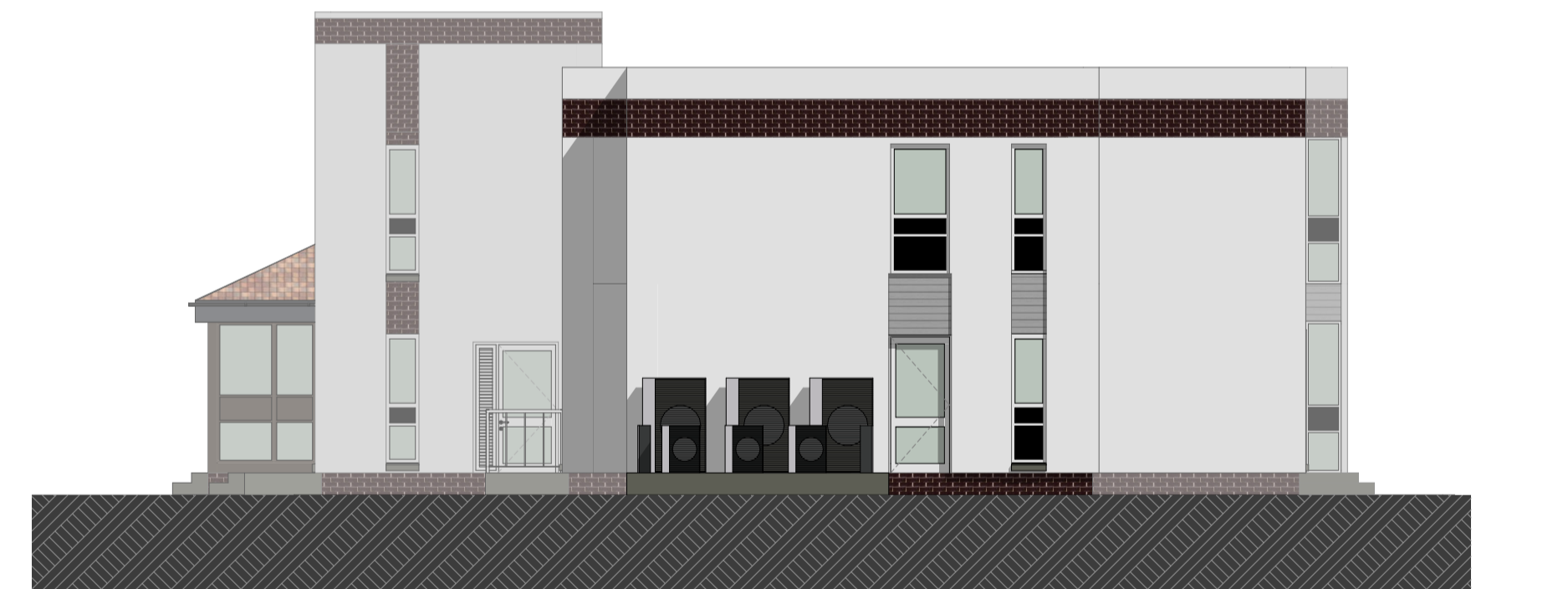
EXISTING WEST ELEVATION SCALE 1:100 0 1 2 3 4 5 6 7 8 9 10