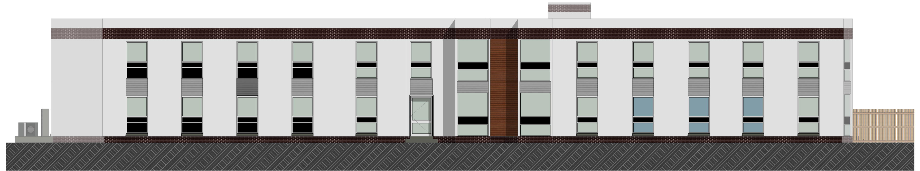
EXISTING SOUTH ELEVATION SCALE 1:100 0 1 2 3 4 5 6 7 8 9 10