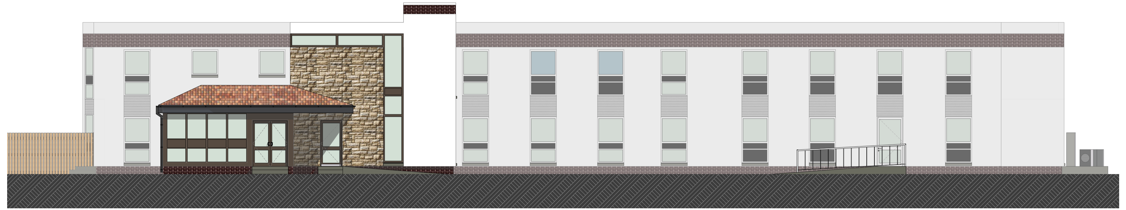
EXISTING NORTH ELEVATION SCALE 1:100 0 1 2 3 4 5 6 7 8 9 10